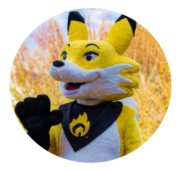
FireSmart BC and BC Wildfire Service