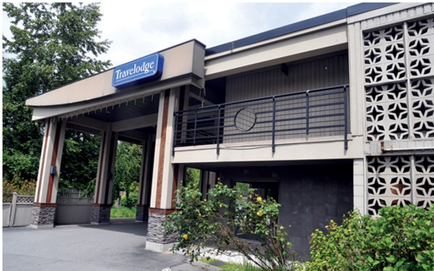
TEMPORARY SHELTER SPACE