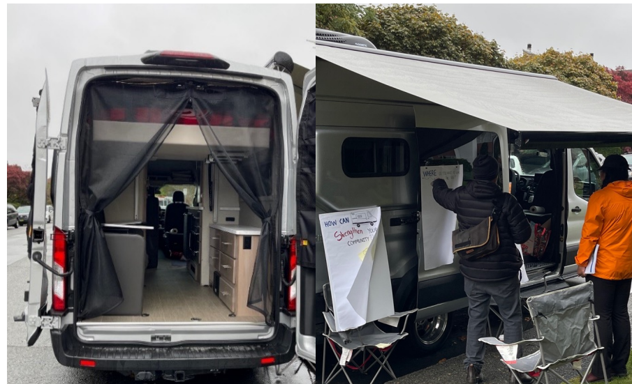
MOBILE OUTREACH SERVICES VAN