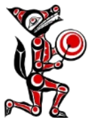
Tseil-Waututh Nation PEOPLE OF THE INLET