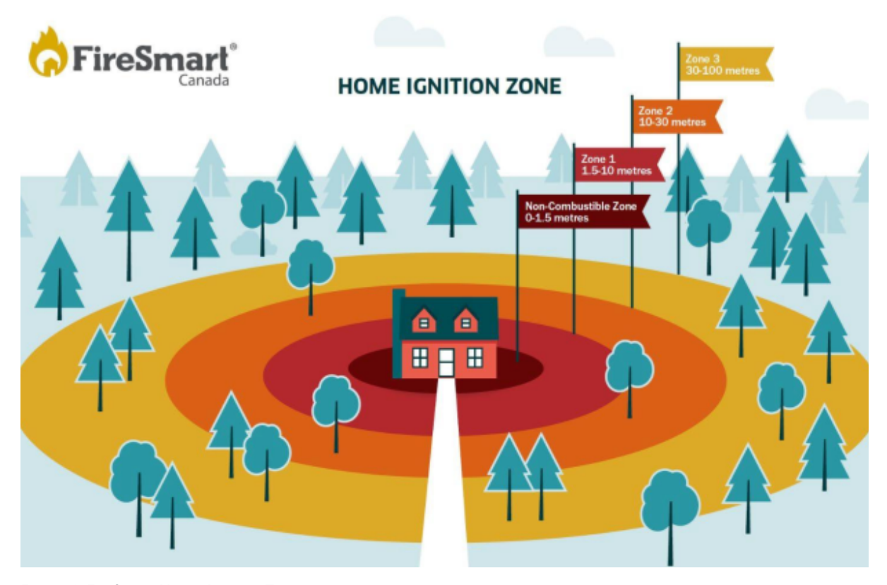
Figure 1. FireSmart Home Ignition Zone

The HIZ typically includes the structure and the immediately adjacent area, extending out to 30 metres from the structure. The HIZ is typically the private property owner's responsibility; however, in developments with smallerlots, the HIZ may extend onto publicly-owned lands or adjacent private lands.