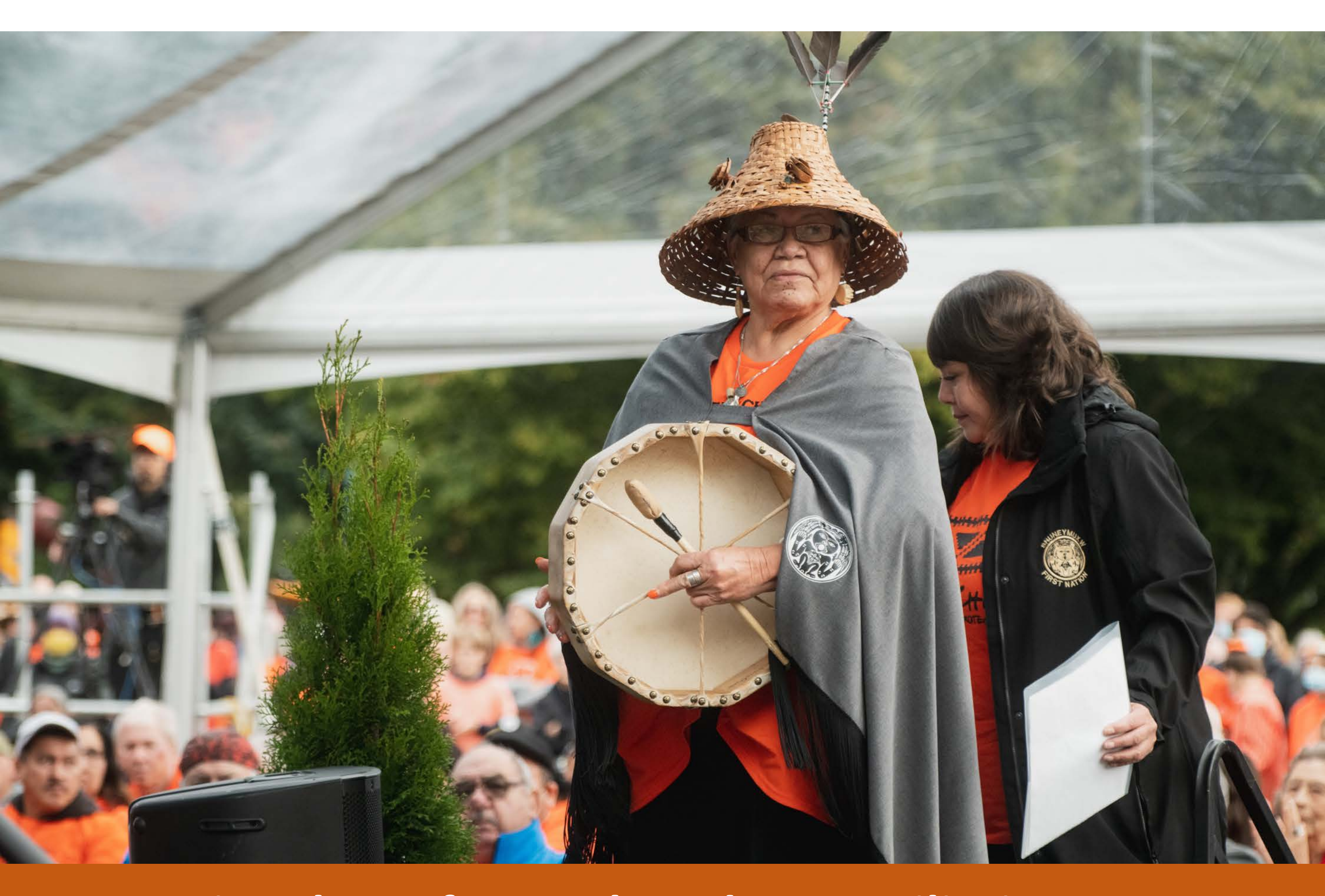
National Day for Truth and Reconciliation 2021