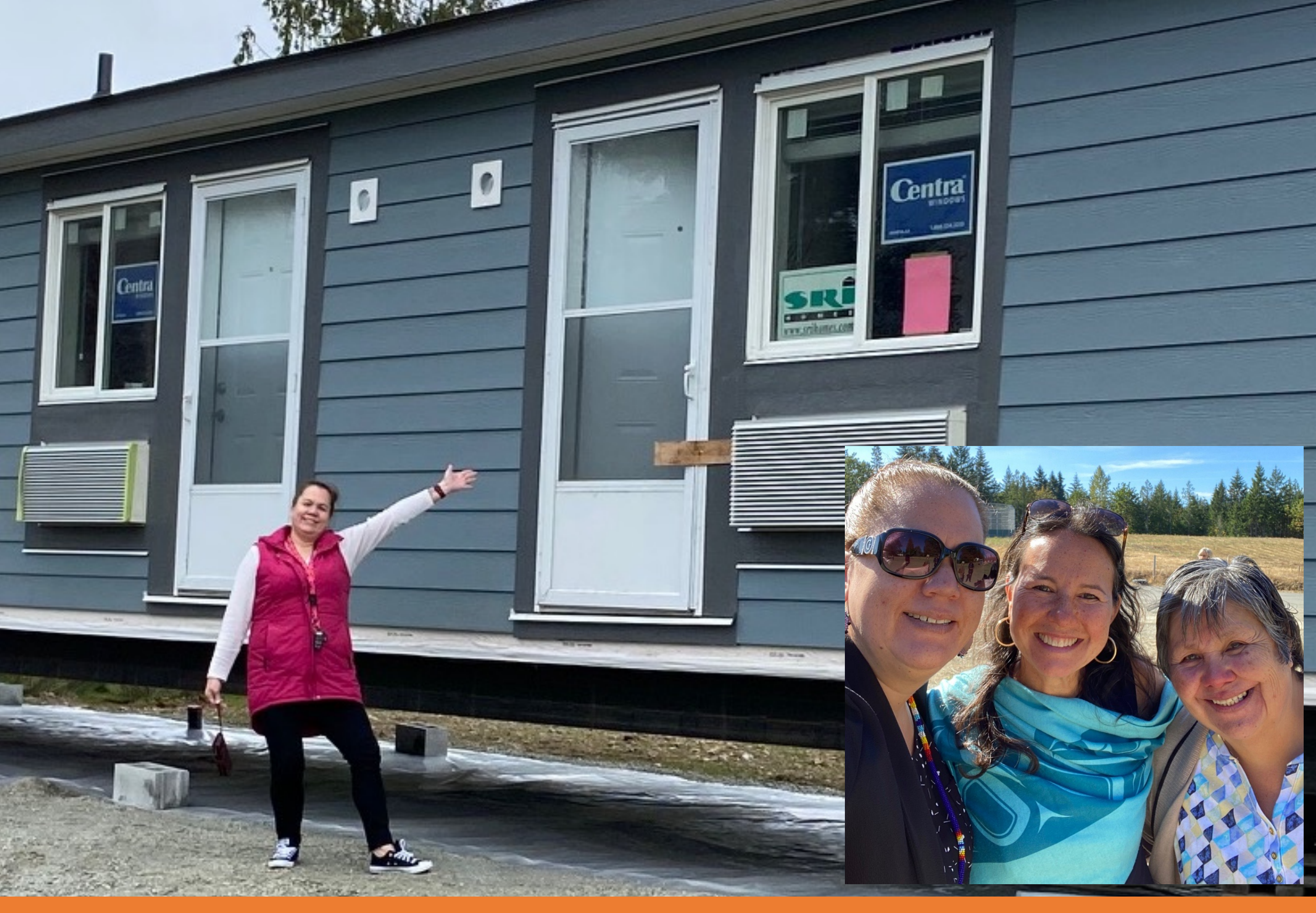
Building on Foundations