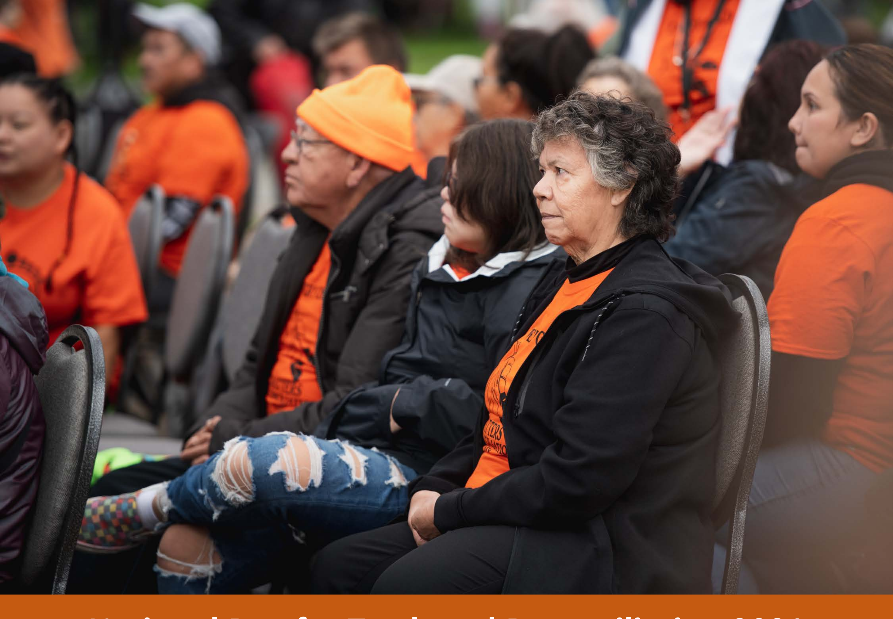
National Day for Truth and Reconciliation 2021