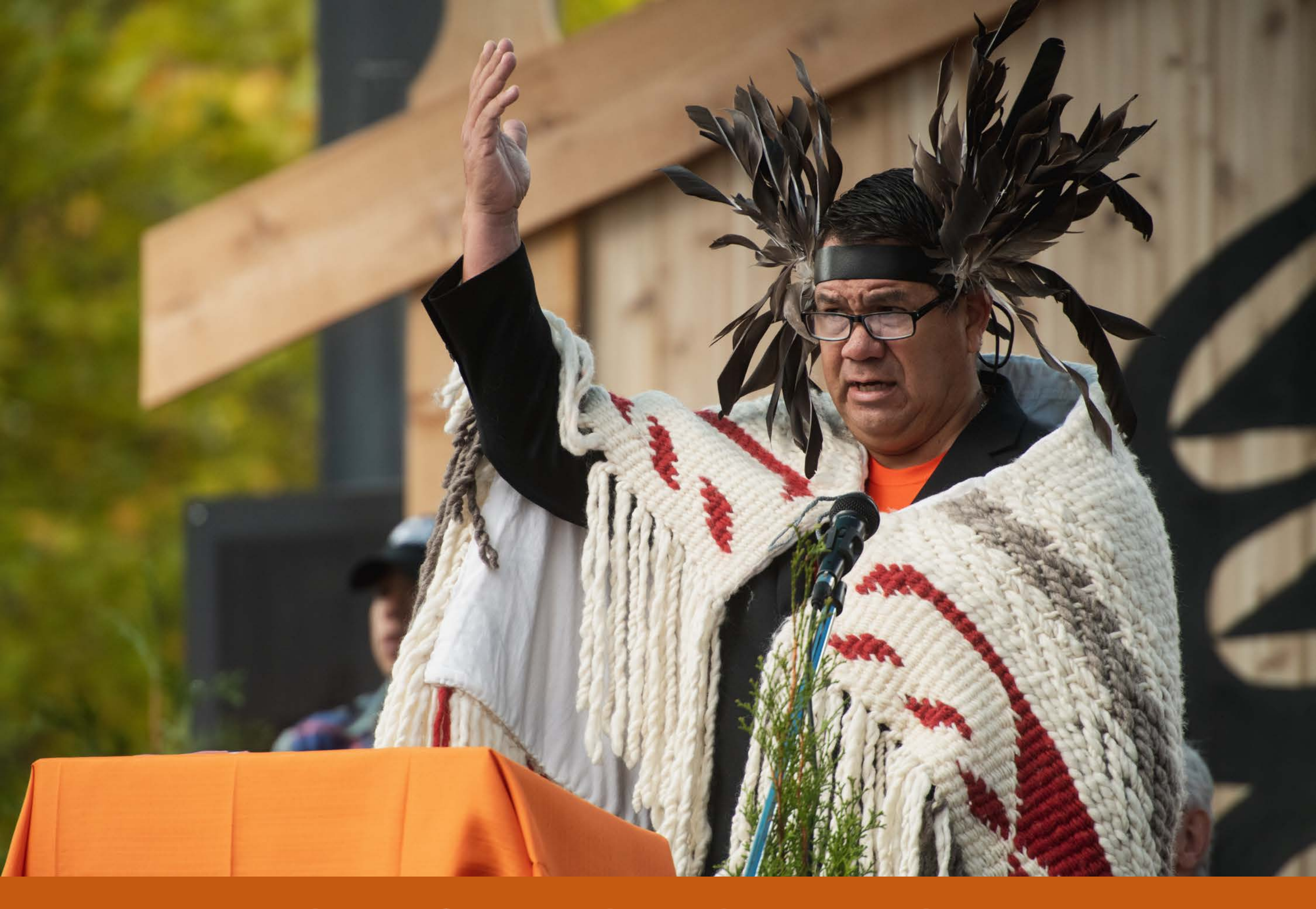
National Day for Truth and Reconciliation 2021