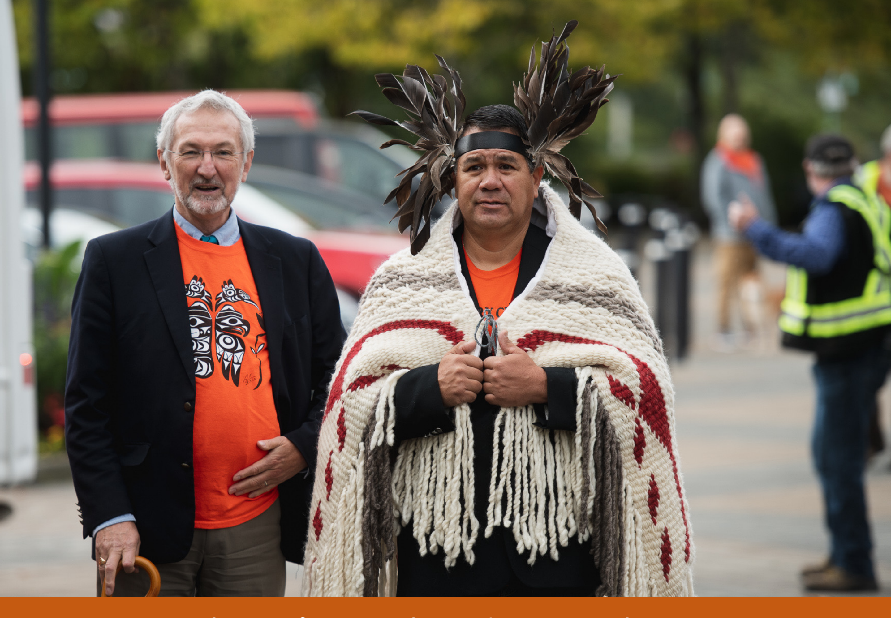
National Day for Truth and Reconciliation 2021