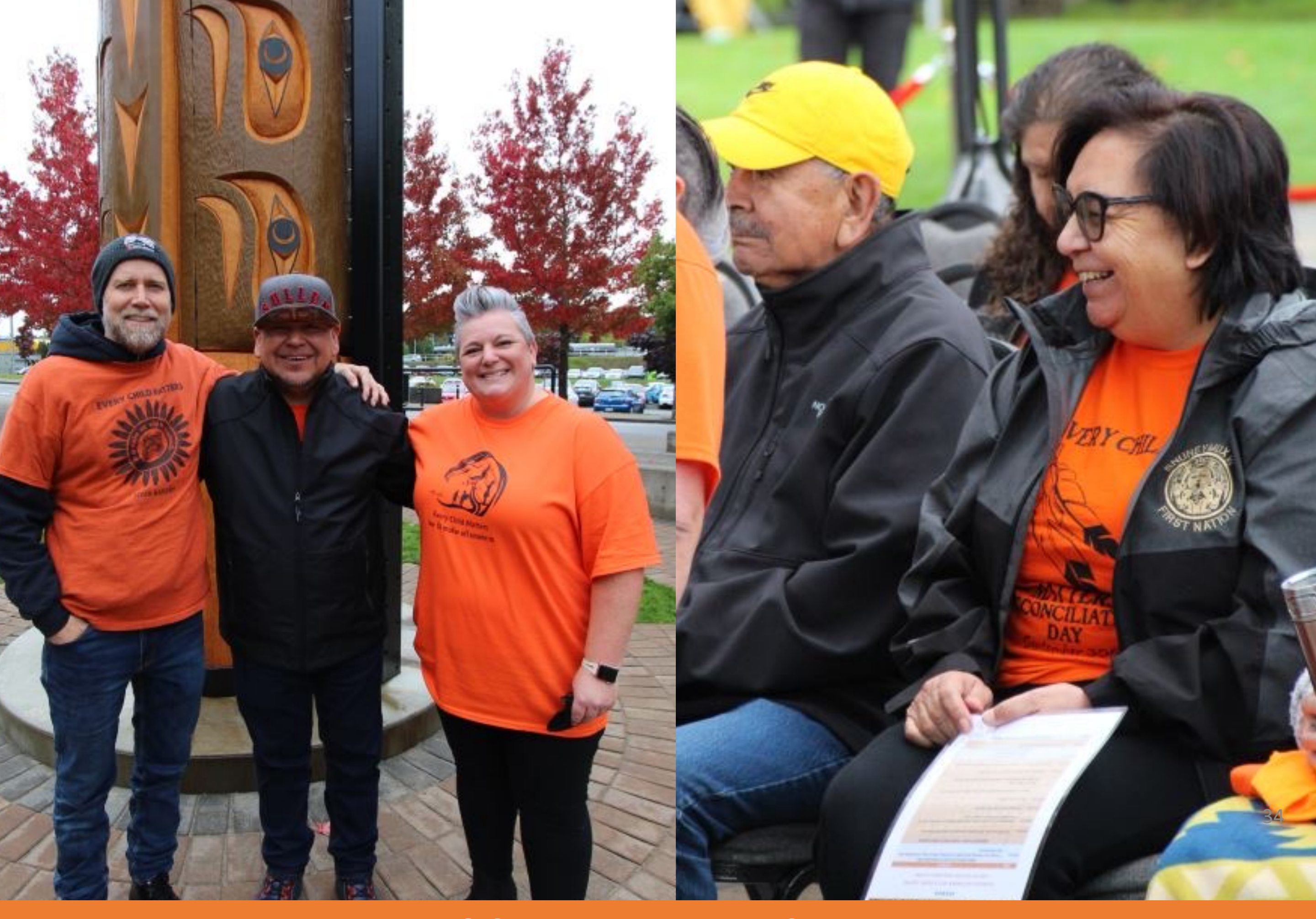
Building on Foundations