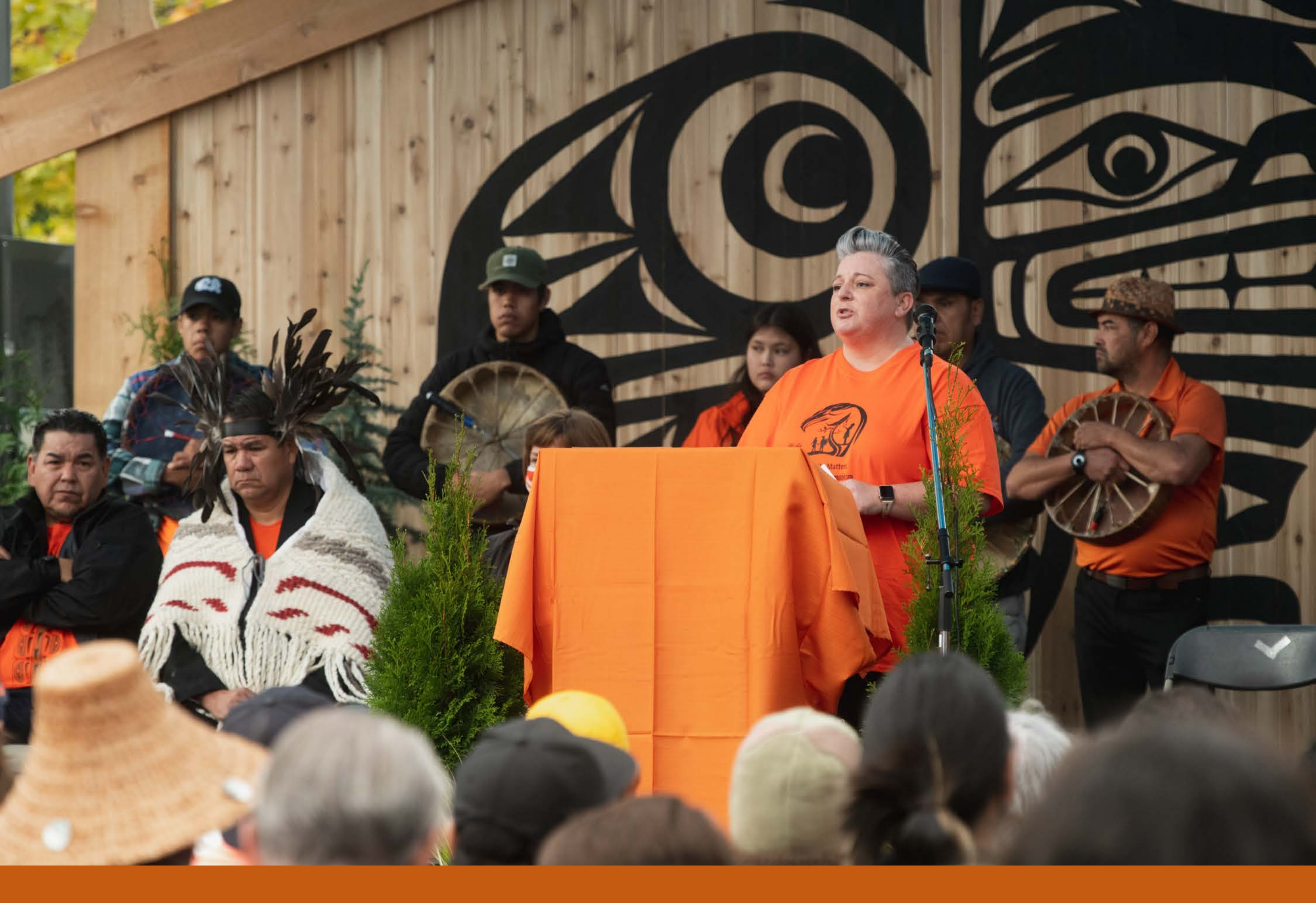
National Day for Truth and Reconciliation 2021