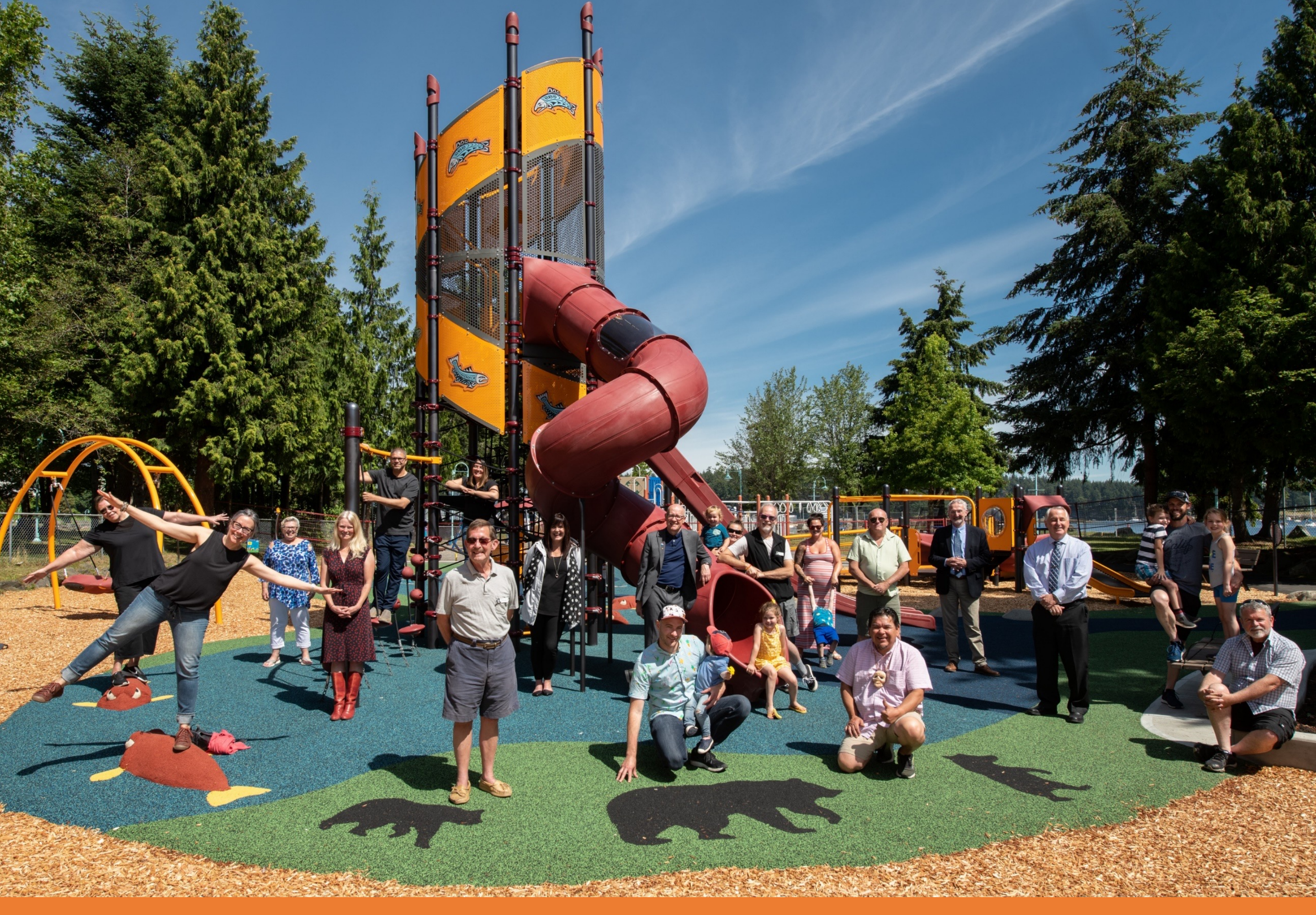
Building on Foundations