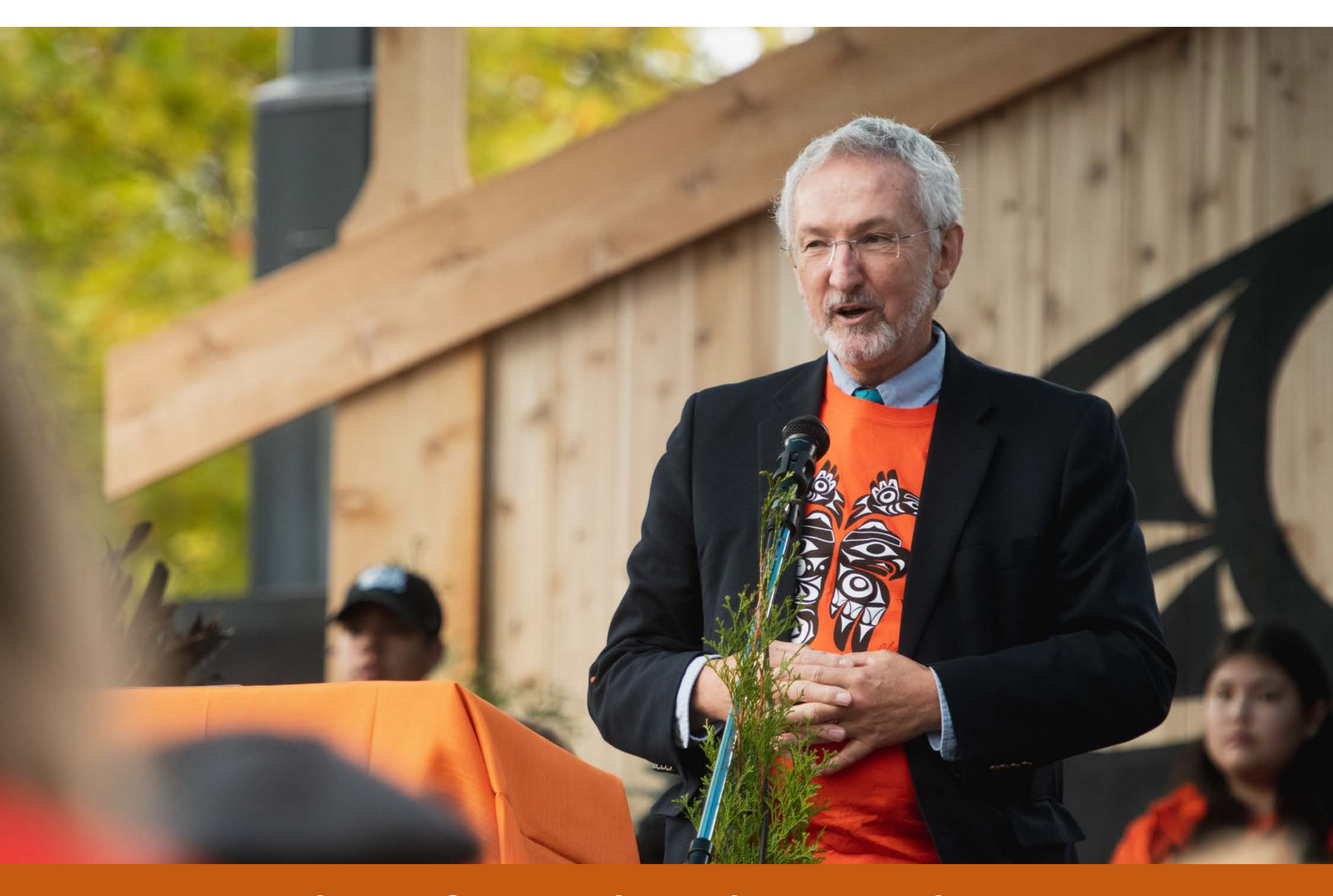
National Day for Truth and Reconciliation 2021