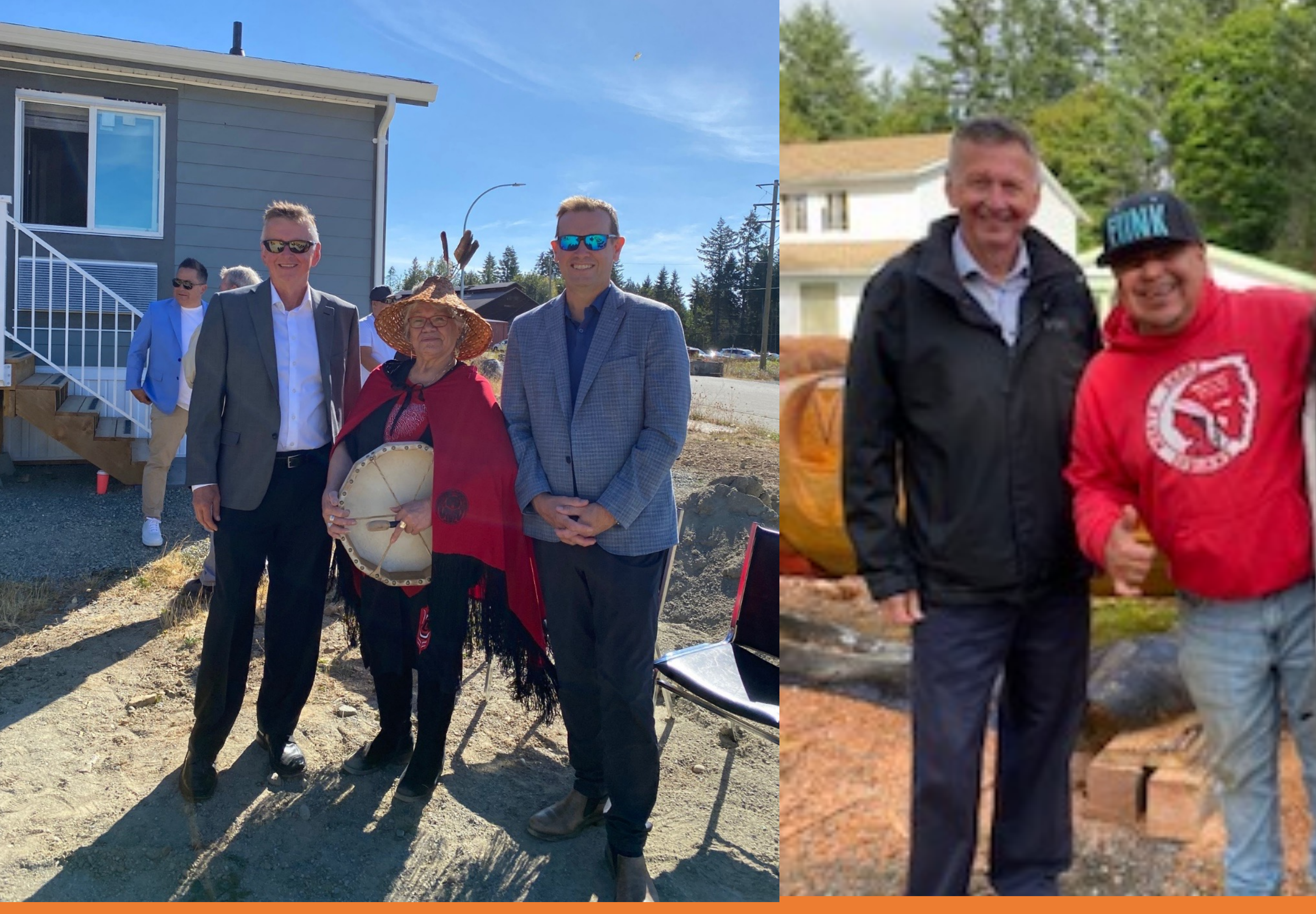
Building on Foundations