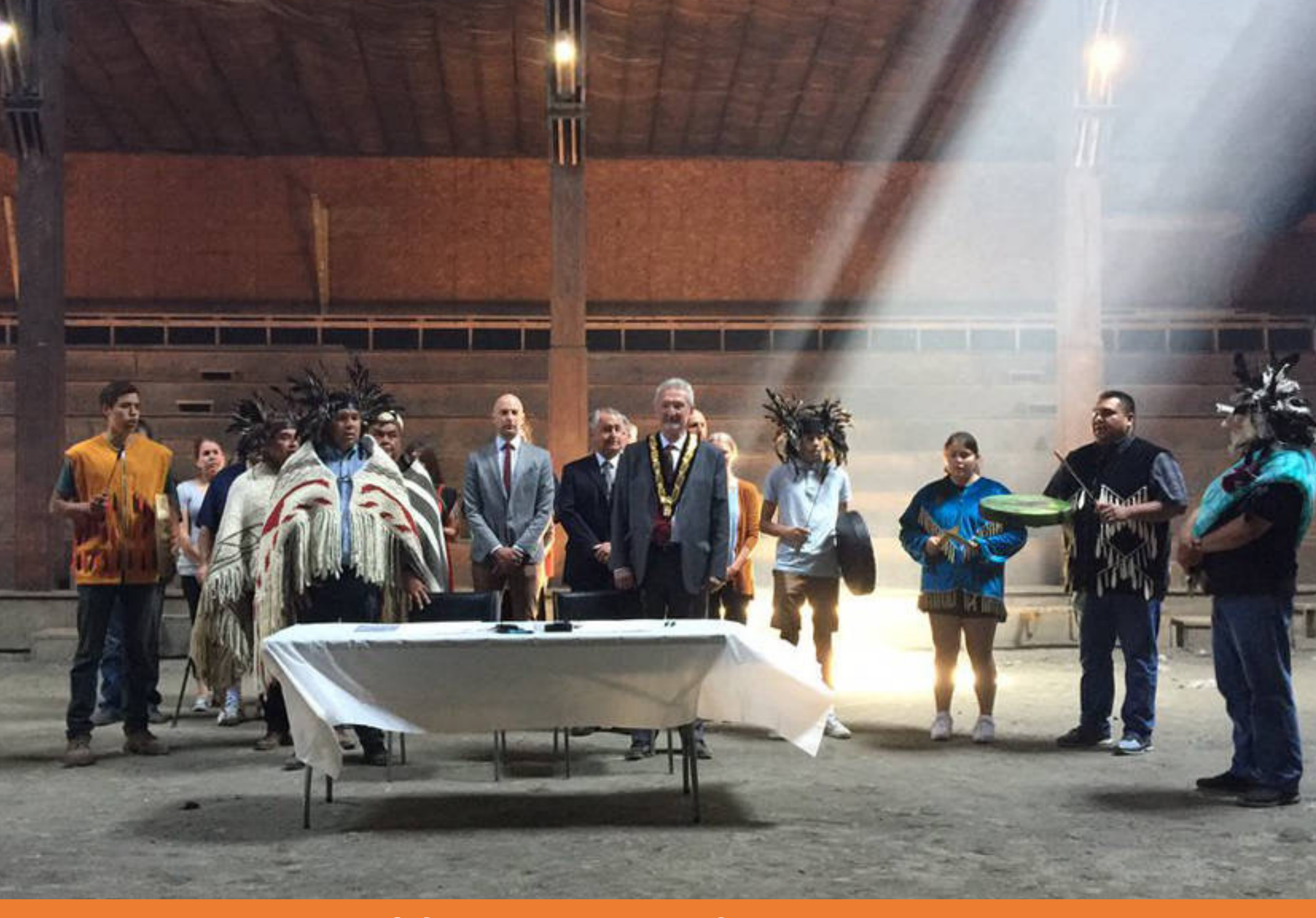
Building on Foundations