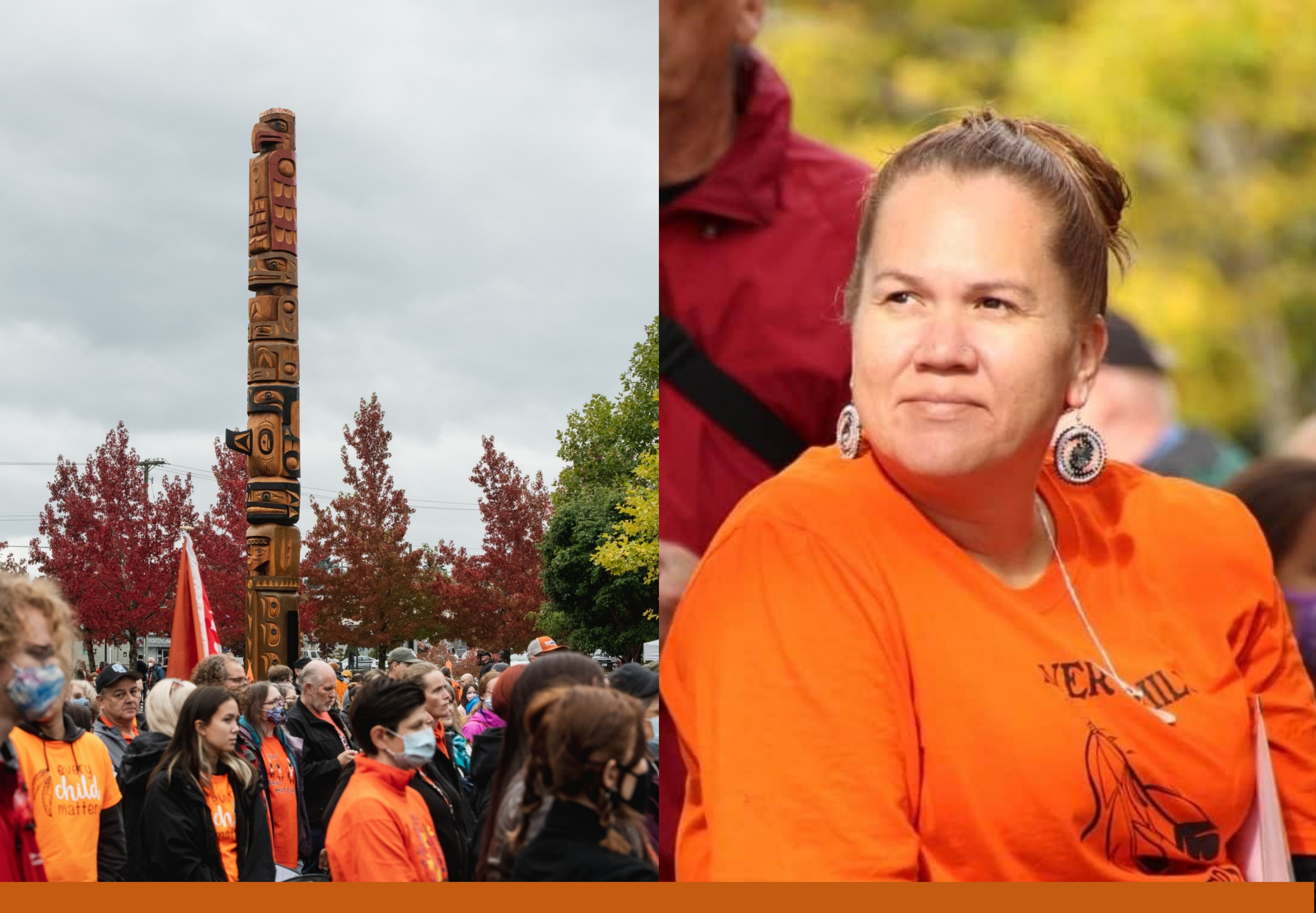
National Day for Truth and Reconciliation 2021