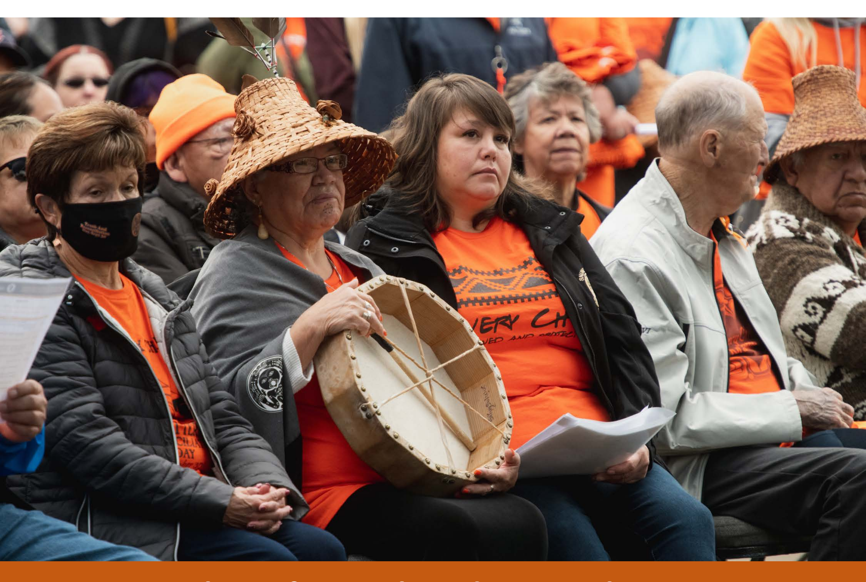
National Day for Truth and Reconciliation 2021