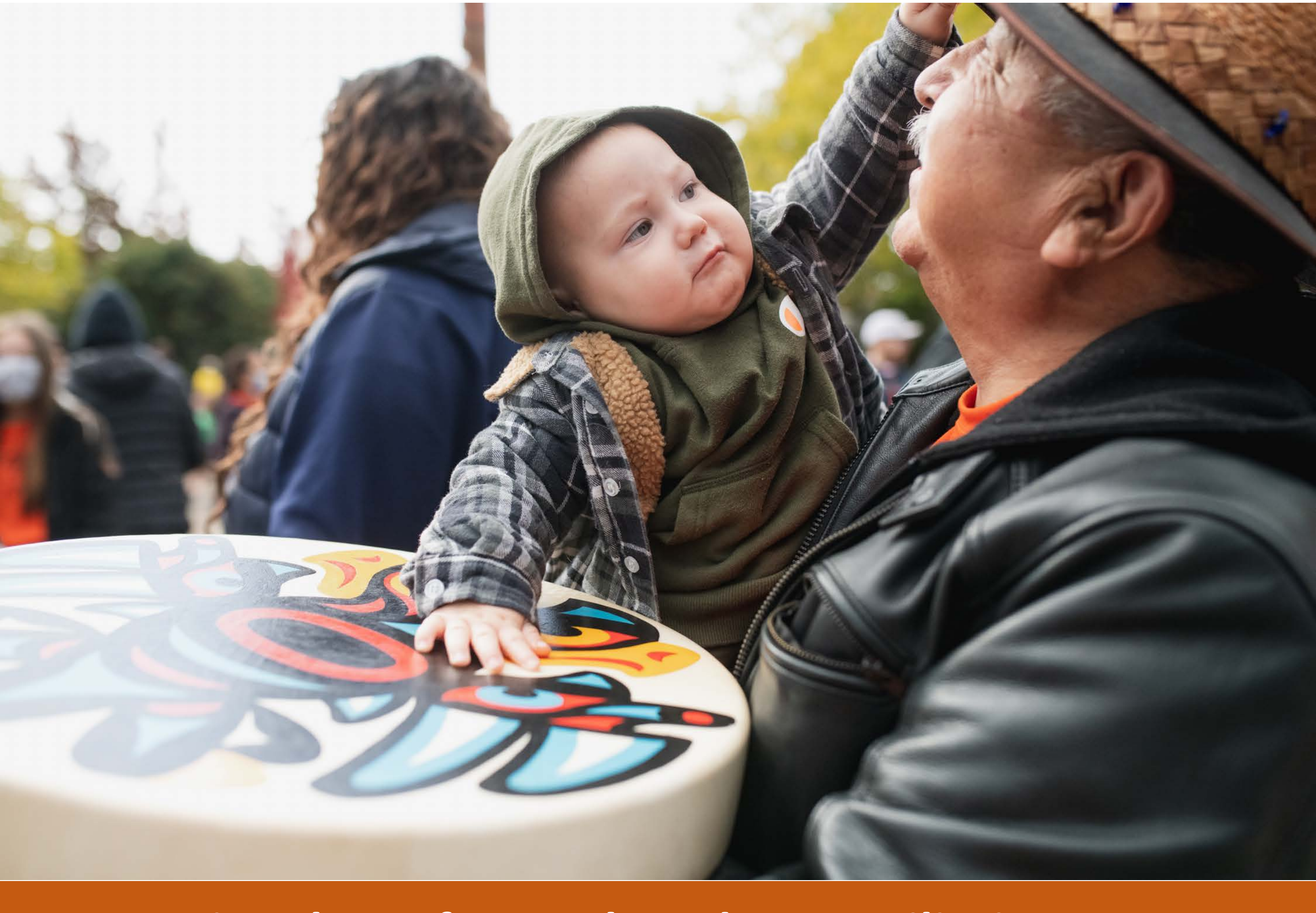
National Day for Truth and Reconciliation 2021