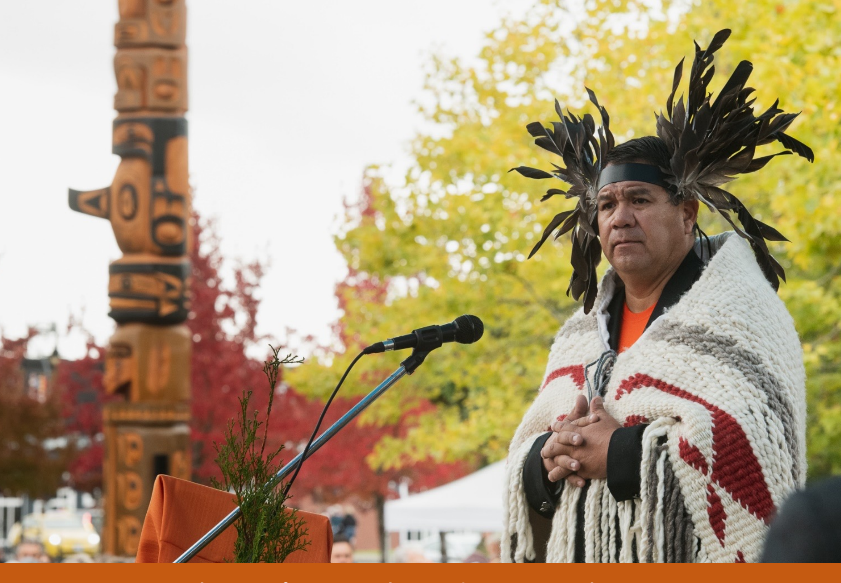
National Day for Truth and Reconciliation 2021