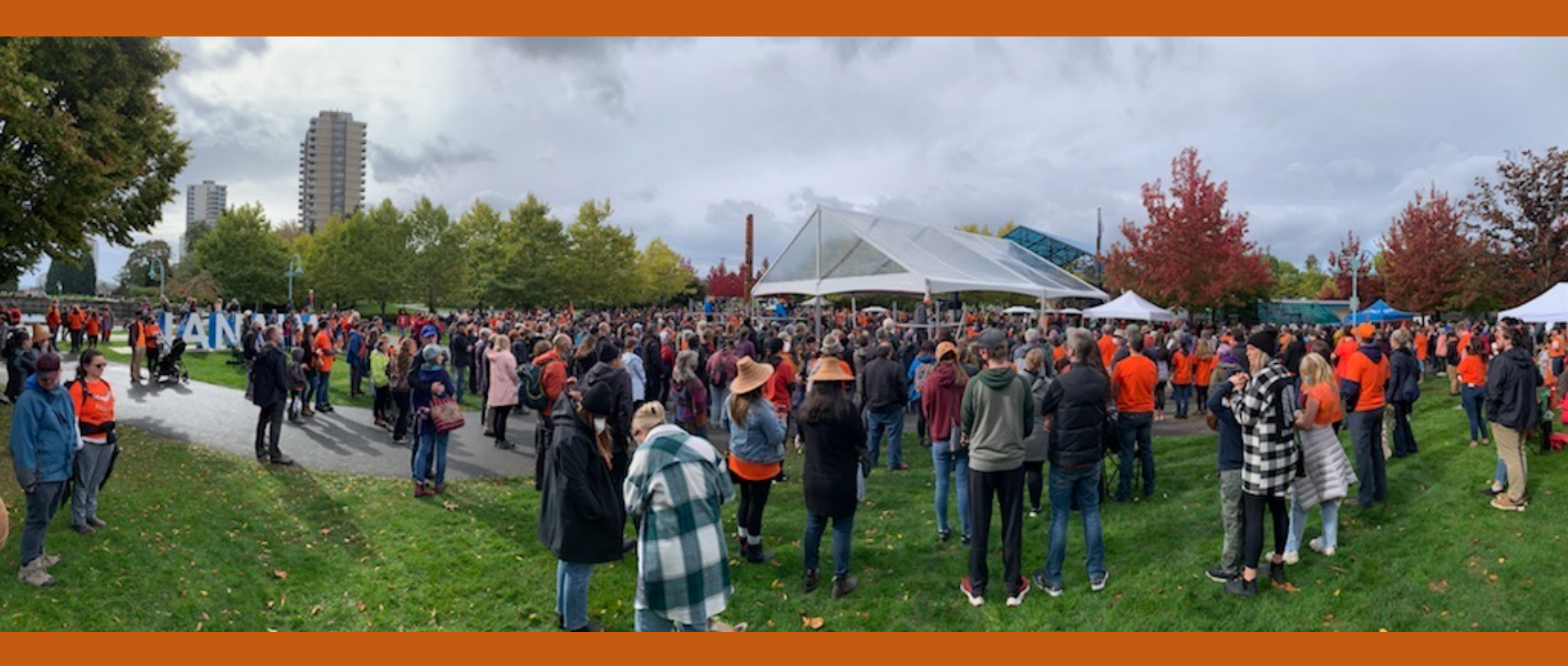
National Day for Truth and Reconciliation 2021