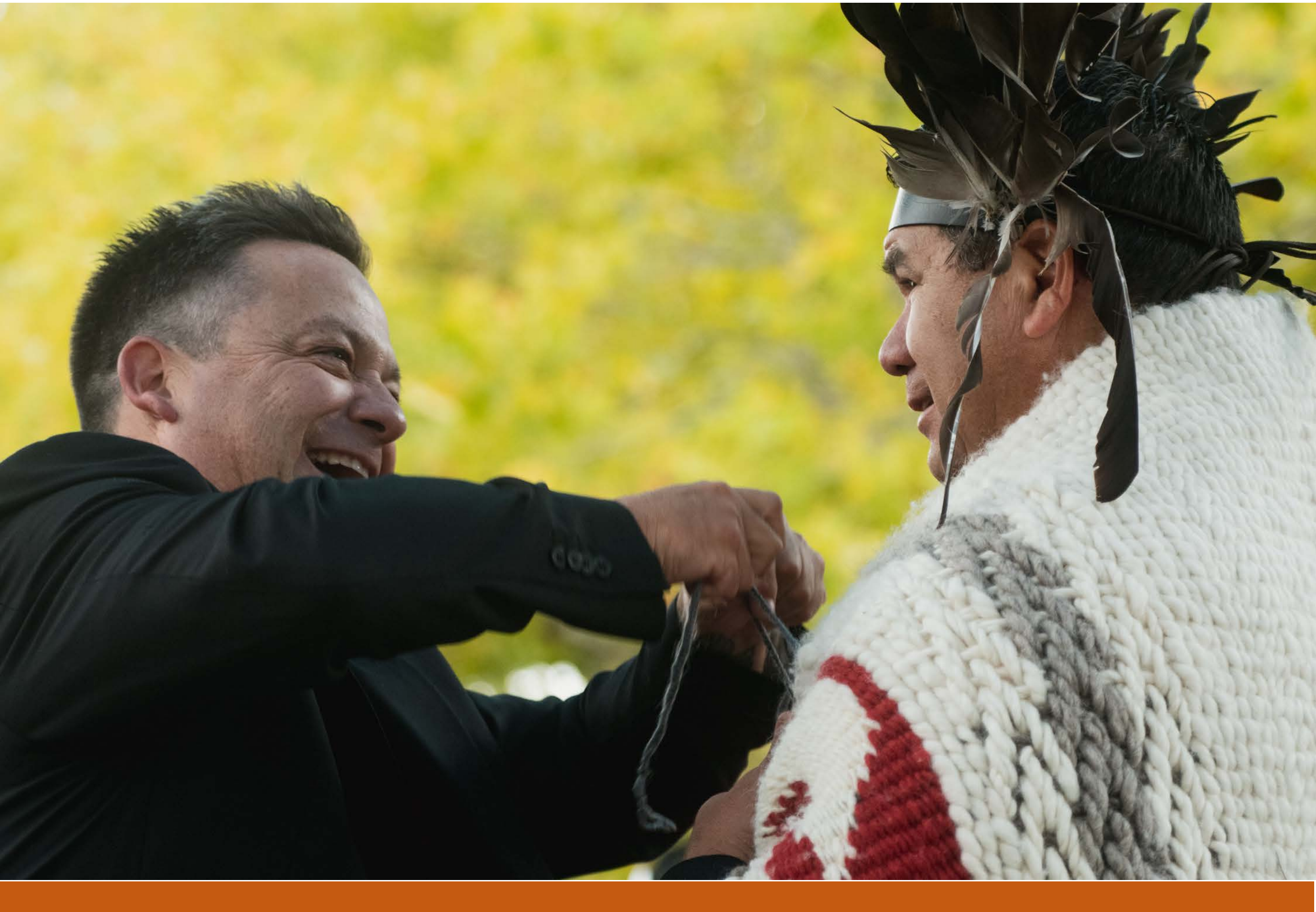
National Day for Truth and Reconciliation 2021