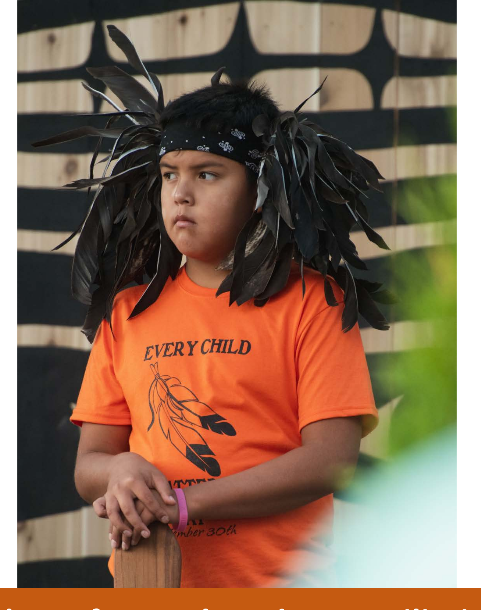
National Day for Truth and Reconciliation 2021