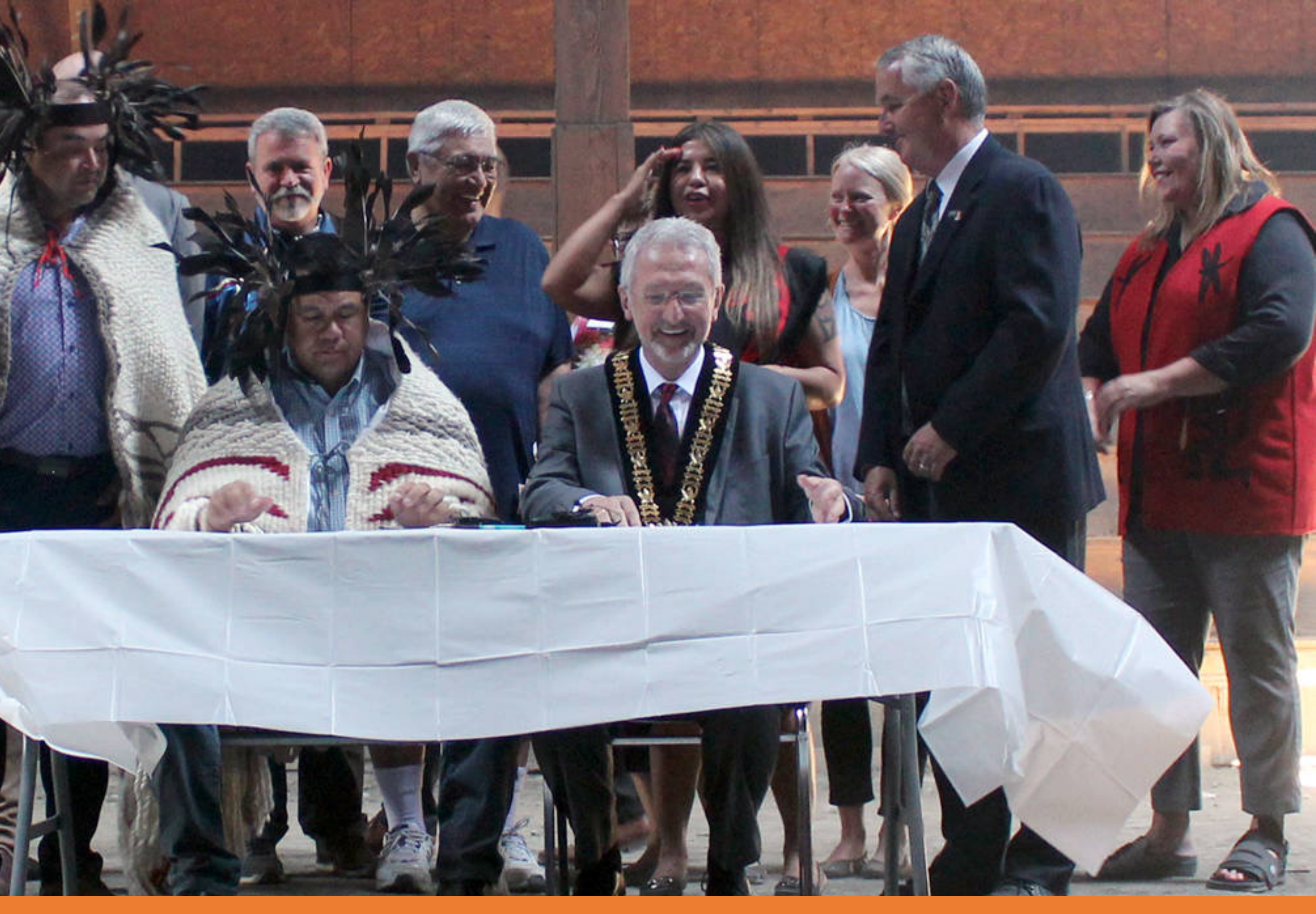
Building on Foundations