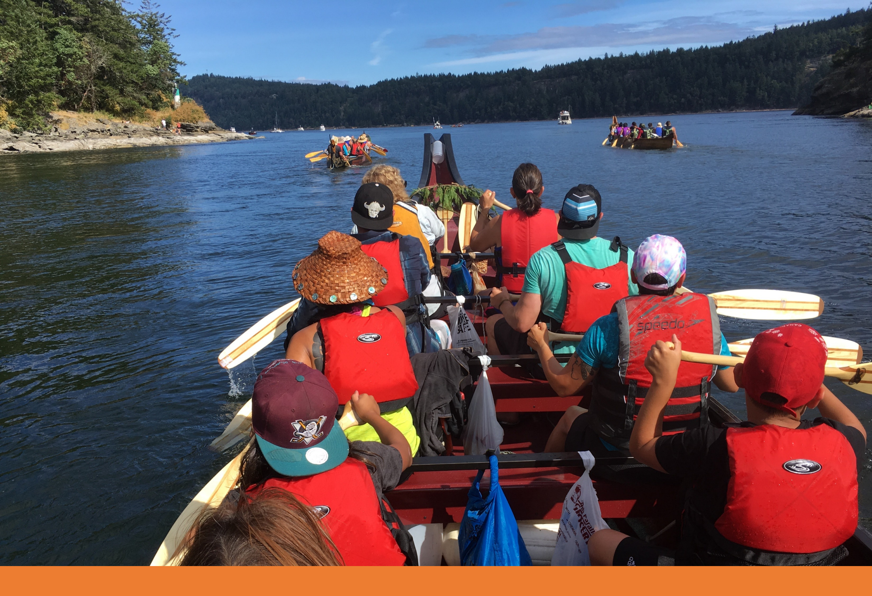
This is not an easy journey....takes time and committment