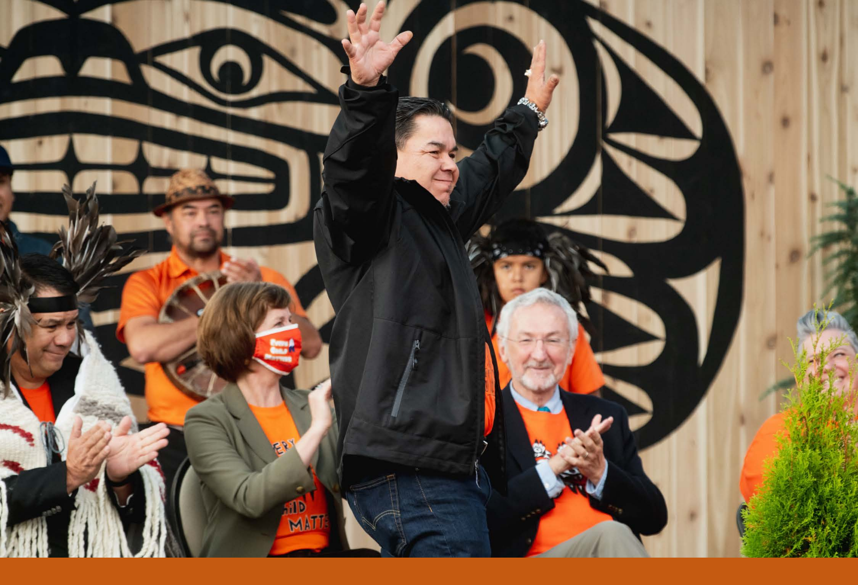
National Day for Truth and Reconciliation 2021