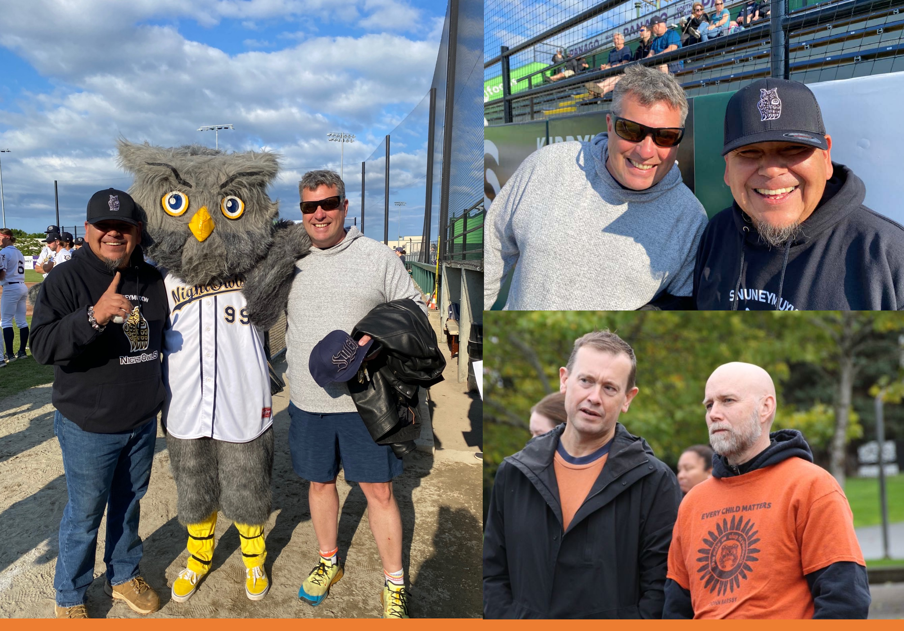
Building on Foundations