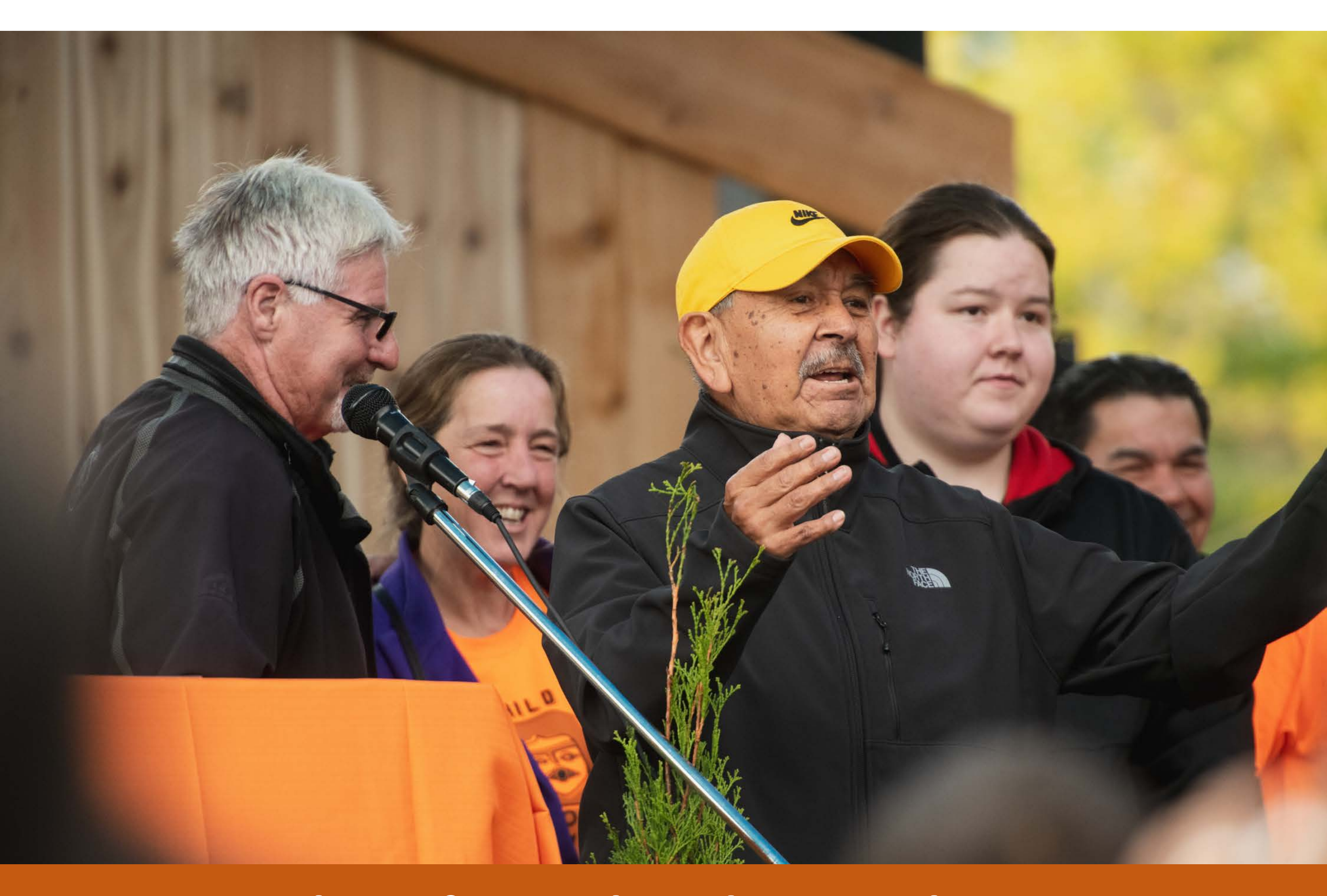
National Day for Truth and Reconciliation 2021