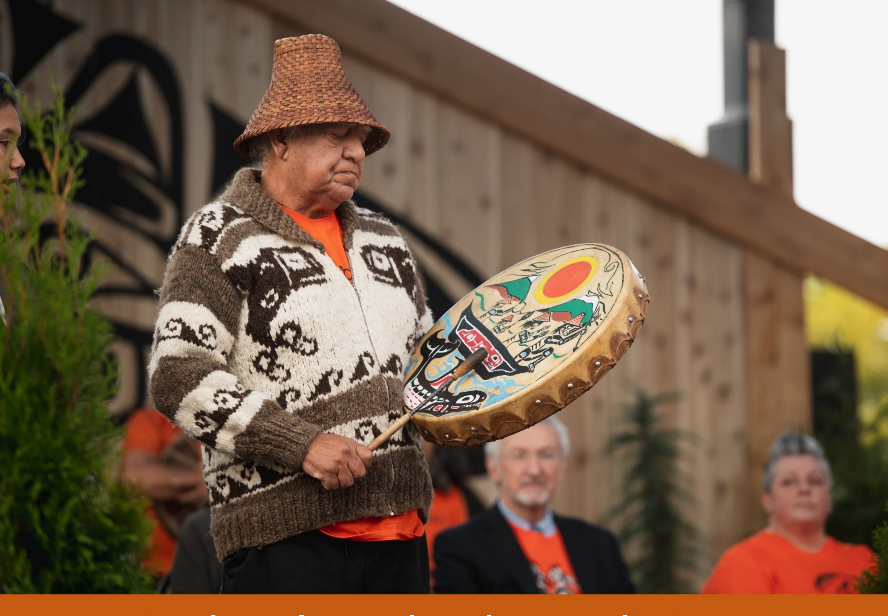
National Day for Truth and Reconciliation 2021