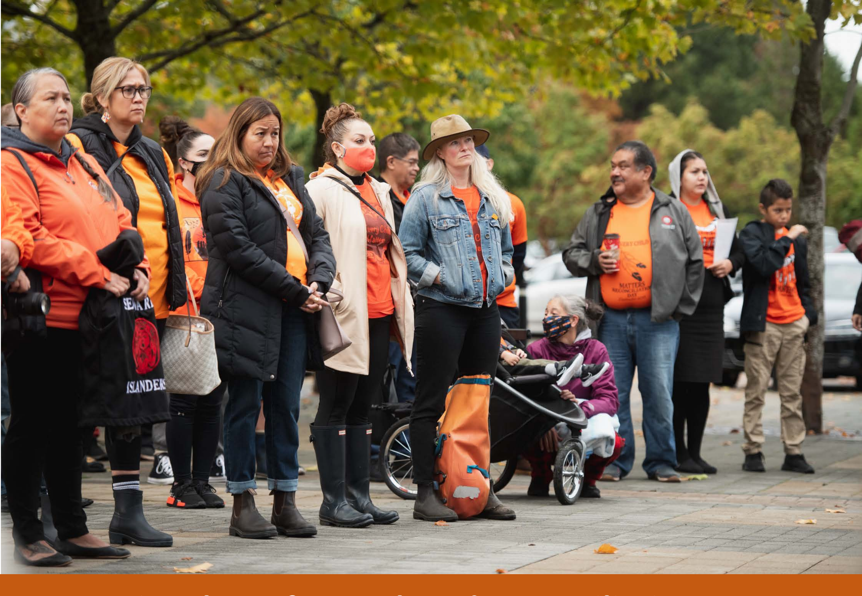
National Day for Truth and Reconciliation 2021