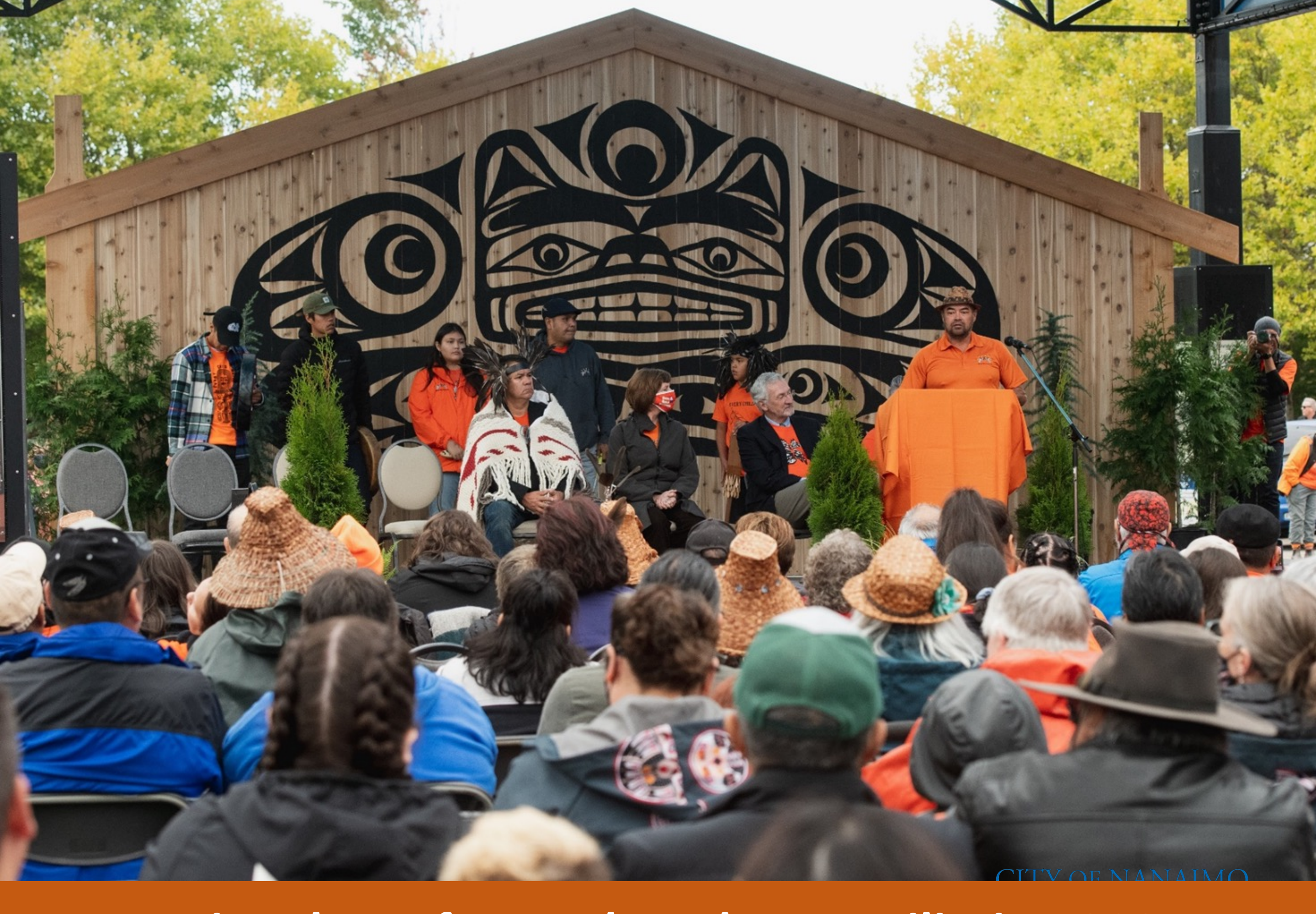
National Day for Truth and Reconciliation 2021