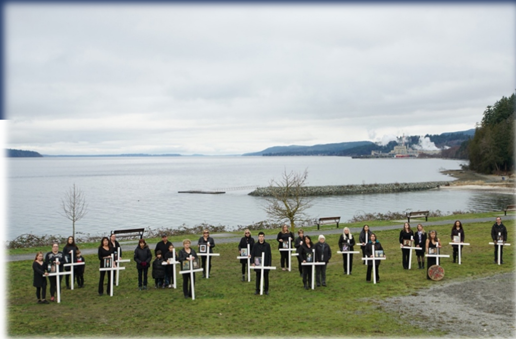
Mom's Stop the Harm photo of Powell River families who have lost loved ones to substance use. January 2020