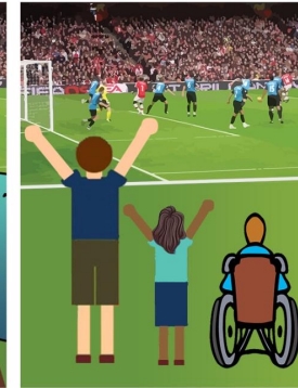
The systemic barrier has been removed. This is Equality.