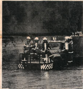
Tahsis volunteer firemen patrolling streets during flooding.

The flood markers along the Tahsis River measured 510 meters on Friday. Public Works employee, Les Dowling seemed to agree with Constable Kimbler, he said, (see Flood, page 3)