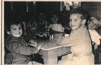
Tahsis children attending Puddle Duck play centre.