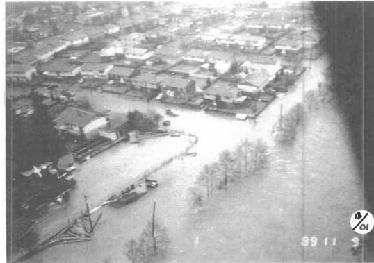
TAHSIS (Photo 4)

Looking downstream at cross section 11 and flooded Maquinna Drive during November 9, 1989 flood.