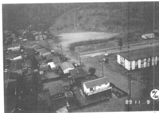
TAHSIS (Photo 5)

Looking downstream at cross section 11 and flooded Maquinna Drive during November 9, 1989 flood.