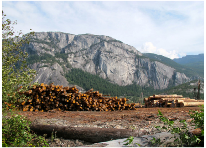
PHOTO: Log sort in Squamish

Community forests can bring many benefits to local communities. Community forests are different from forests that are under provincial management. Under the province, forestry contracts are awarded through BC Timber Sales and contracts are generally awarded to the highest bidder. Community forest governance also allows the District and the Nation to share in a portion of the profits from the forestry activity.