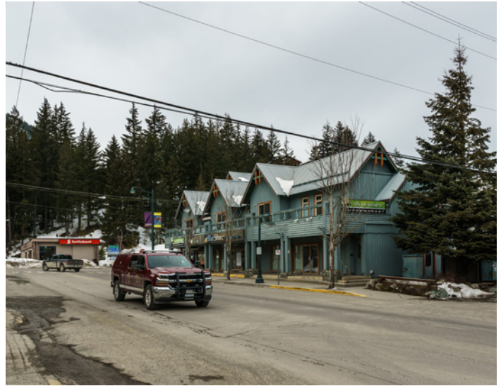
PHOTO: Sharing services among both communities, like Pemberton Fire Rescue, helps to create opportunities for training and other initiatives that support Lil'wat Nation in establishing their own services.

In 2017, Pemberton prioritized establishing stronger ties with Lil'wat Nation by expanding their knowledge of the traditions and culture of their important neighbours. To accomplish this, Council and staff attended the “Building Bridges Through Understanding” workshop, organized in partnership with the Squamish-Lillooet Regional District (SLRD). The Village was also invited to sit on an organizing committee for a regional gathering focused on relationship building and exploring the meaning of reconciliation. Following the gathering a number of recommendations were put forth to Councils in attendance to further relationship building and collaboration. One of the recommendations led to Pemberton working with Lil'wat