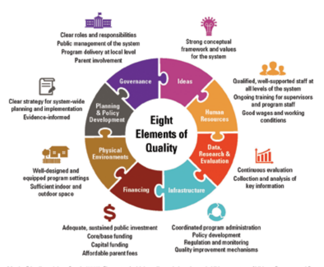
(Source: Martha Friendly and Jane Beach, (2005). Elements of a high quality early learning and child care system. Childcare Resource and Research Unit.)

These elements are: (1) Ideas, (2) Human Resources (3) Data, Research and Evaluation (4) Infrastructure (5) Financing, (6) Physical Environment (7) Policy and Planning Development (8) Governance<sup>5</sup>. All elements are interconnected and essential to create a strong system; individually they do not have as much impact.