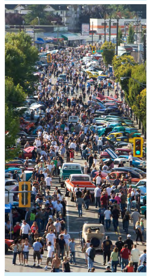
Langley City, BC