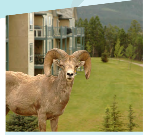
Radium Hot Springs, BC