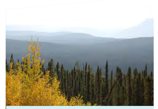
Fort St. John, BC