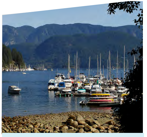
North Vancouver District, BC