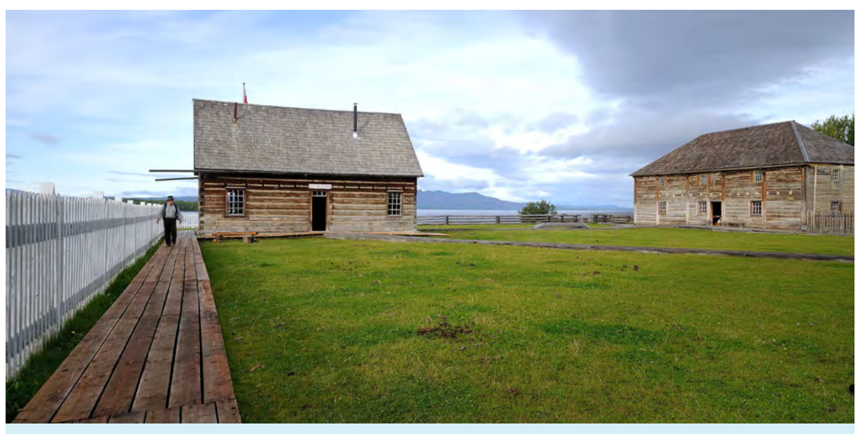
Fort St. James , BC