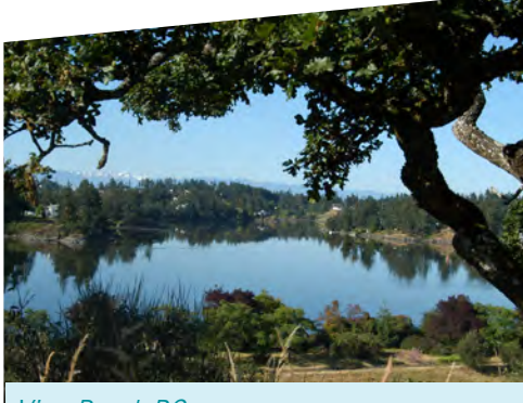
View Royal, BC