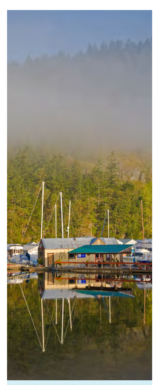
North Cowichan, BC

We strive for continuous improvement in all that we do.