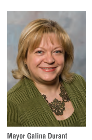
District of Stewart Small Community Representative Community Economic Development Committee Healthy Communities Committee, Vice-Chair