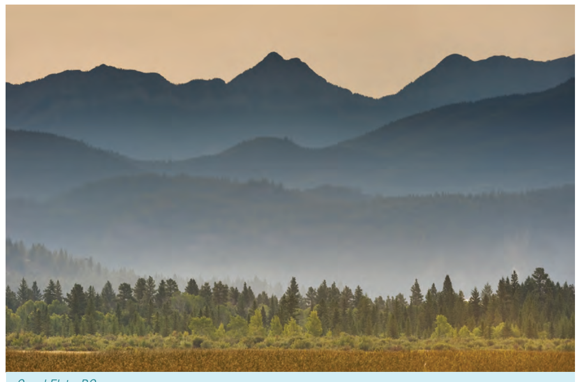
Canal Flats, BC

Every year, UBCM produces a very useful Local Government Planner and Wall Calendar, noting dates of importance to local governments. Over 1180 Planners and Calendars were purchased this year.