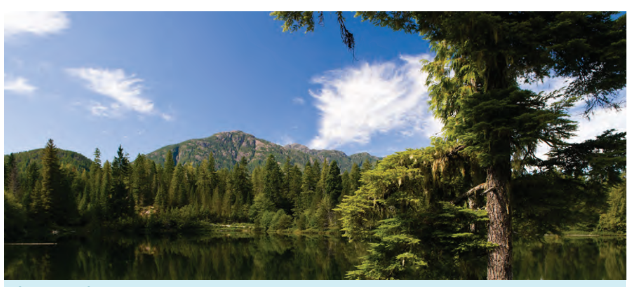
Gold River, BC