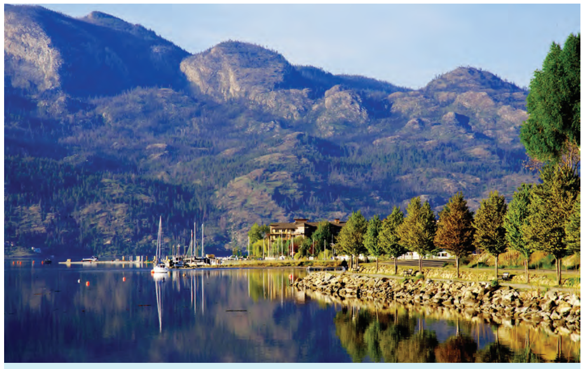
West Kelowna, BC

In addition to the Executive and Committees, many policy topics are covered off through ongoing working groups, committees and meetings that UBCM appointments and staff attend. These policy matters are summarized in the section that follows the Committee overviews.