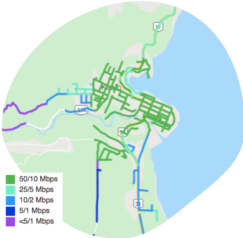
Broadband Accessibility Map (ISED)