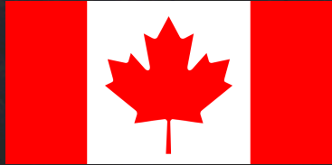
Section 91 (Federal Powers)