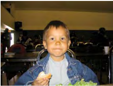
The youngest participant in a Northern BC First Nations workshop

The United Native Nations Local 560 in Port Alberni is an example of a First Nations group that was very successful in establishing a community task force. When determining the scope of their project, a great deal of research was undertaken to determine the range of existing resources, and gaps in the provision of services, that specifically considered the challenges of First Nations people struggling with addictions.