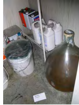
Crystal Meth Production is an ongoing concern for communities

In order to ensure that any future activities are relevant to community based Task Forces, opportunities for consultation are currently being developed. A meeting of Vancouver Island Task Forces was held earlier this year; and other meetings are currently being considered around the province. These meetings will allow information sharing between community groups, as well as provide an opportunity for program administrators to survey attendees to determine future needs.