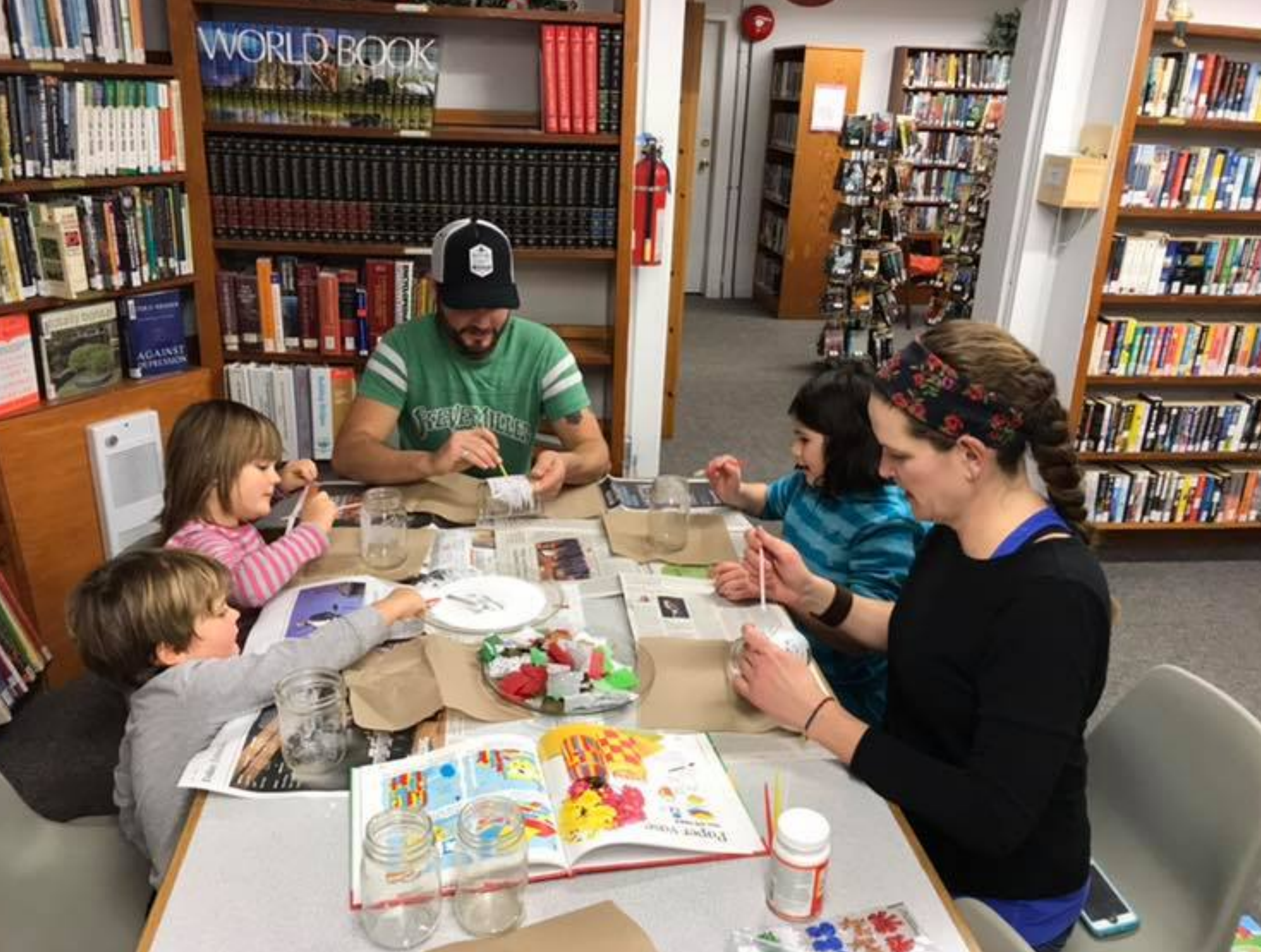
Greenwood Public Library