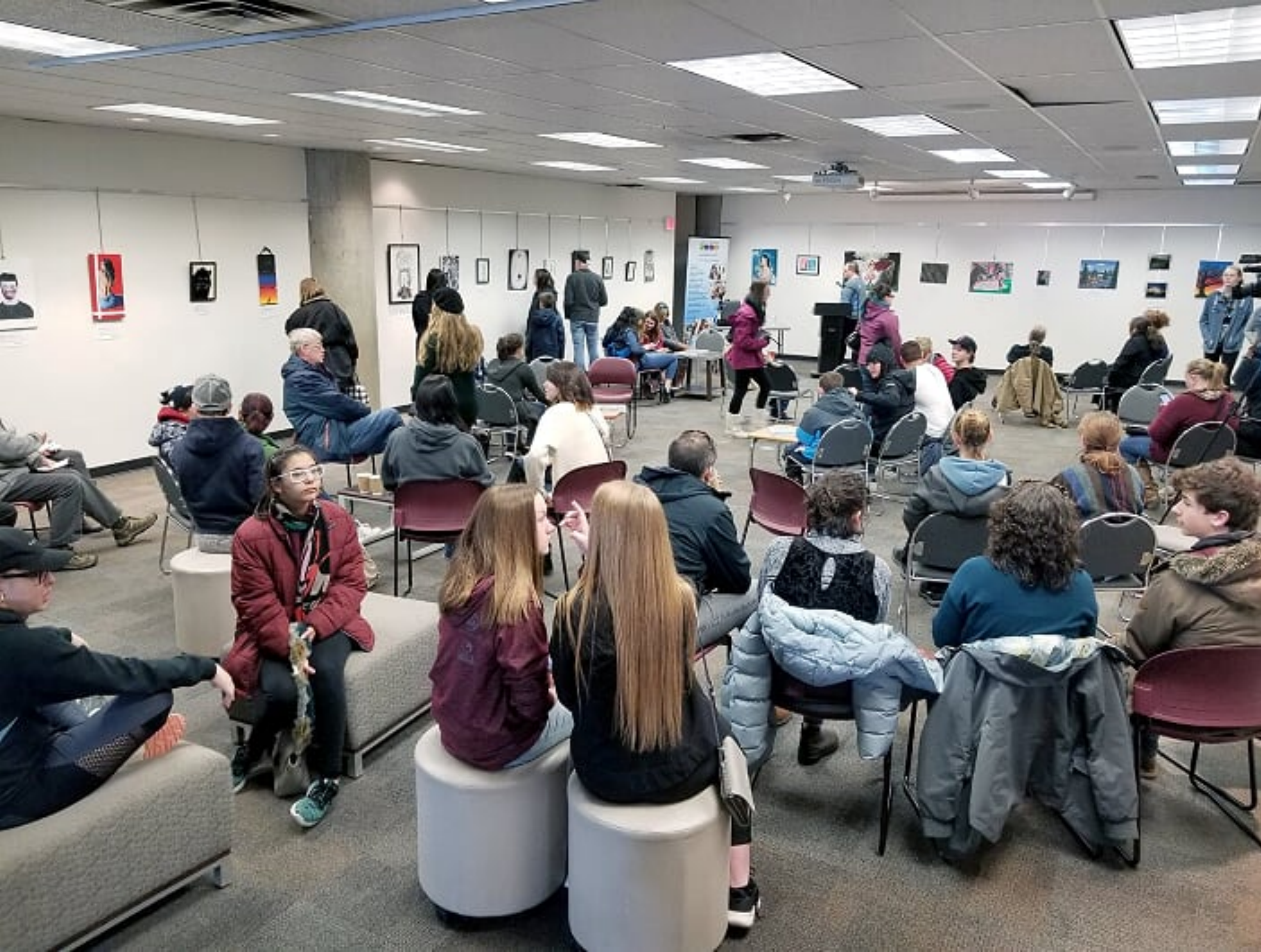
Prince George Public Library