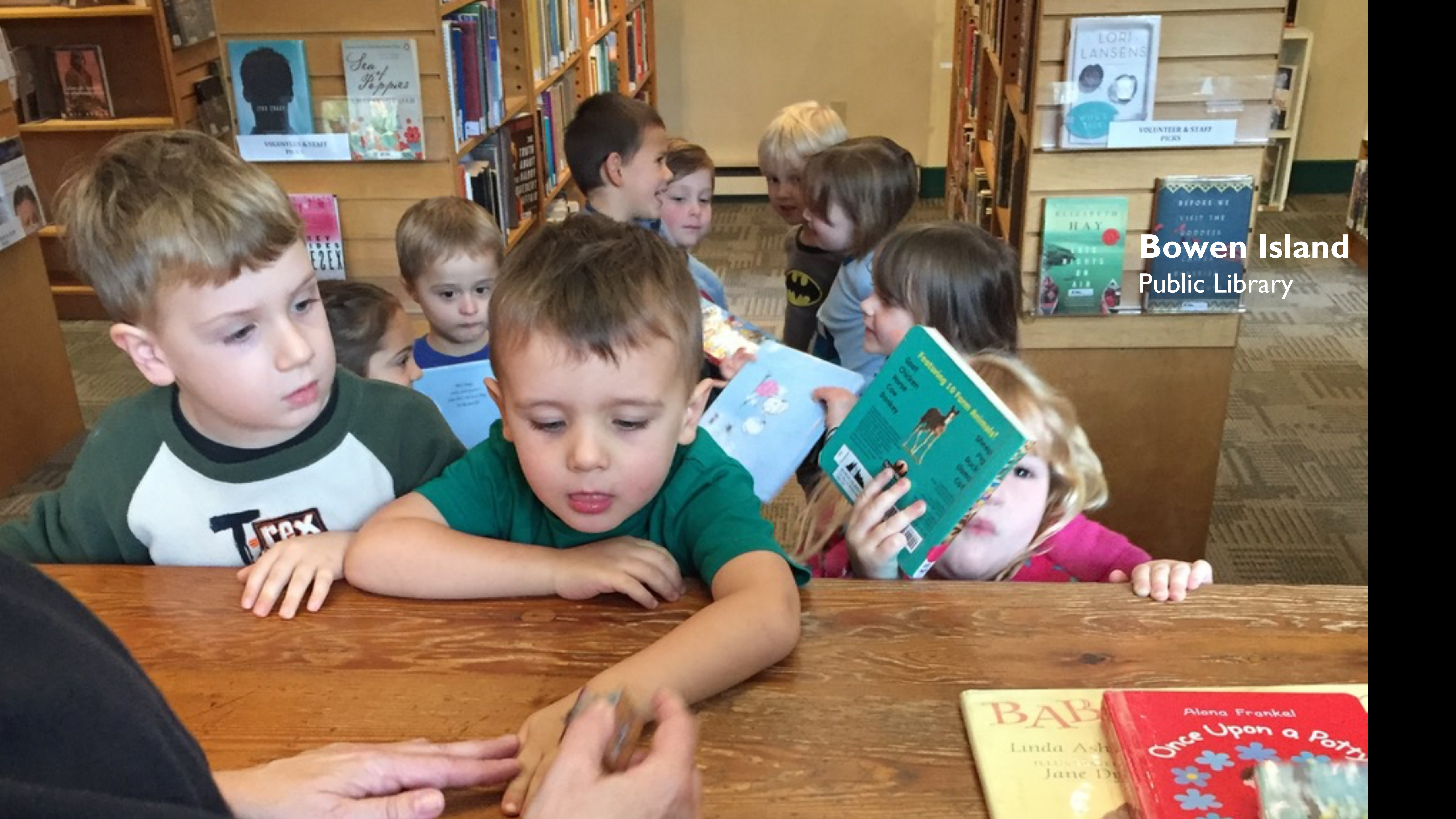
Bowen Island Public Library