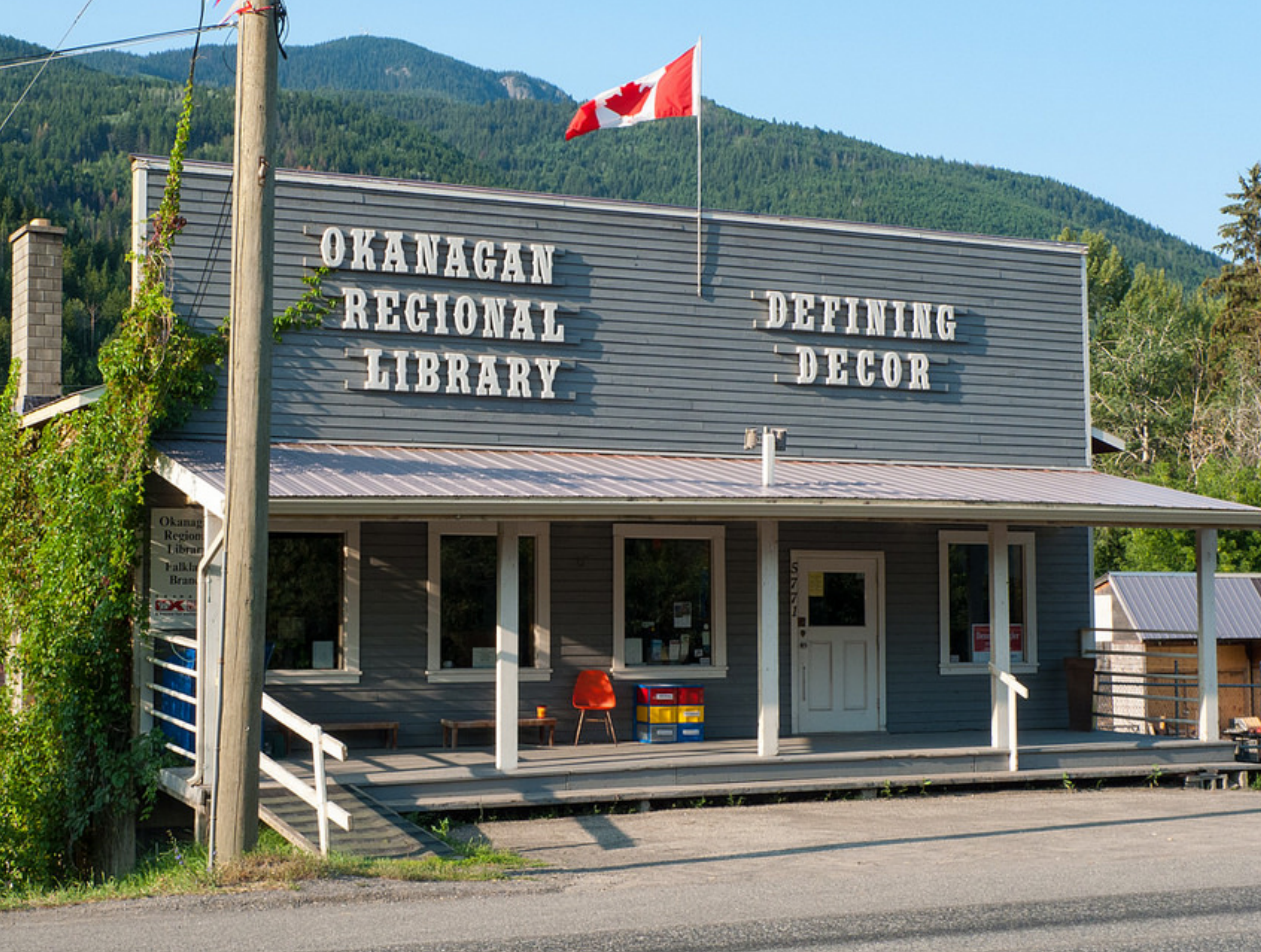
Okanagan Regional Library