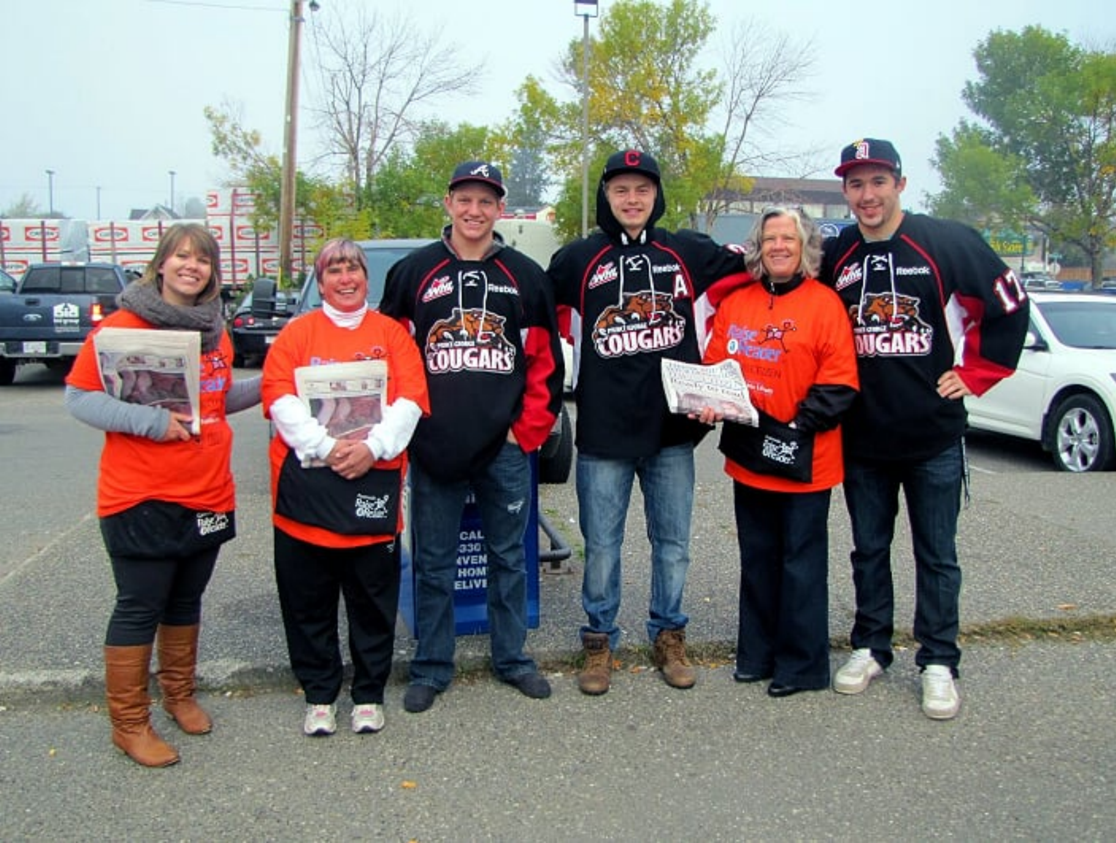
Prince George Public Library