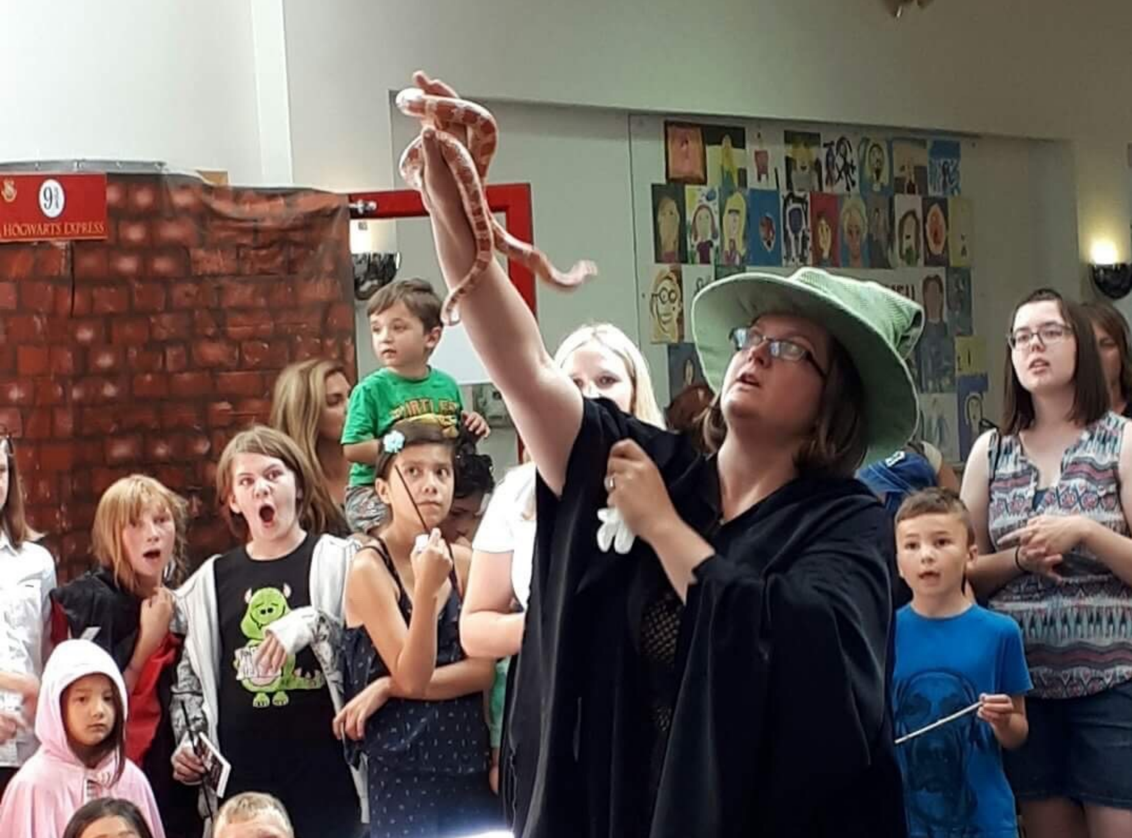
Fort St. John Public Library