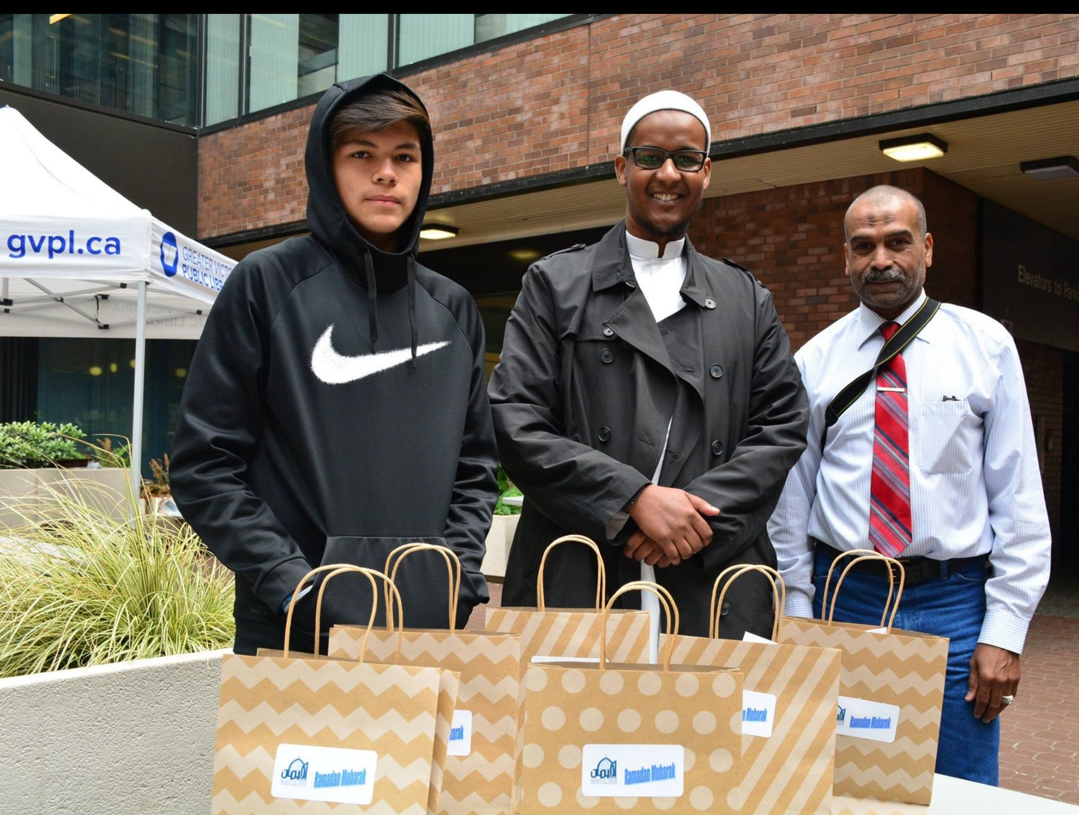
Greater Victoria Public Library