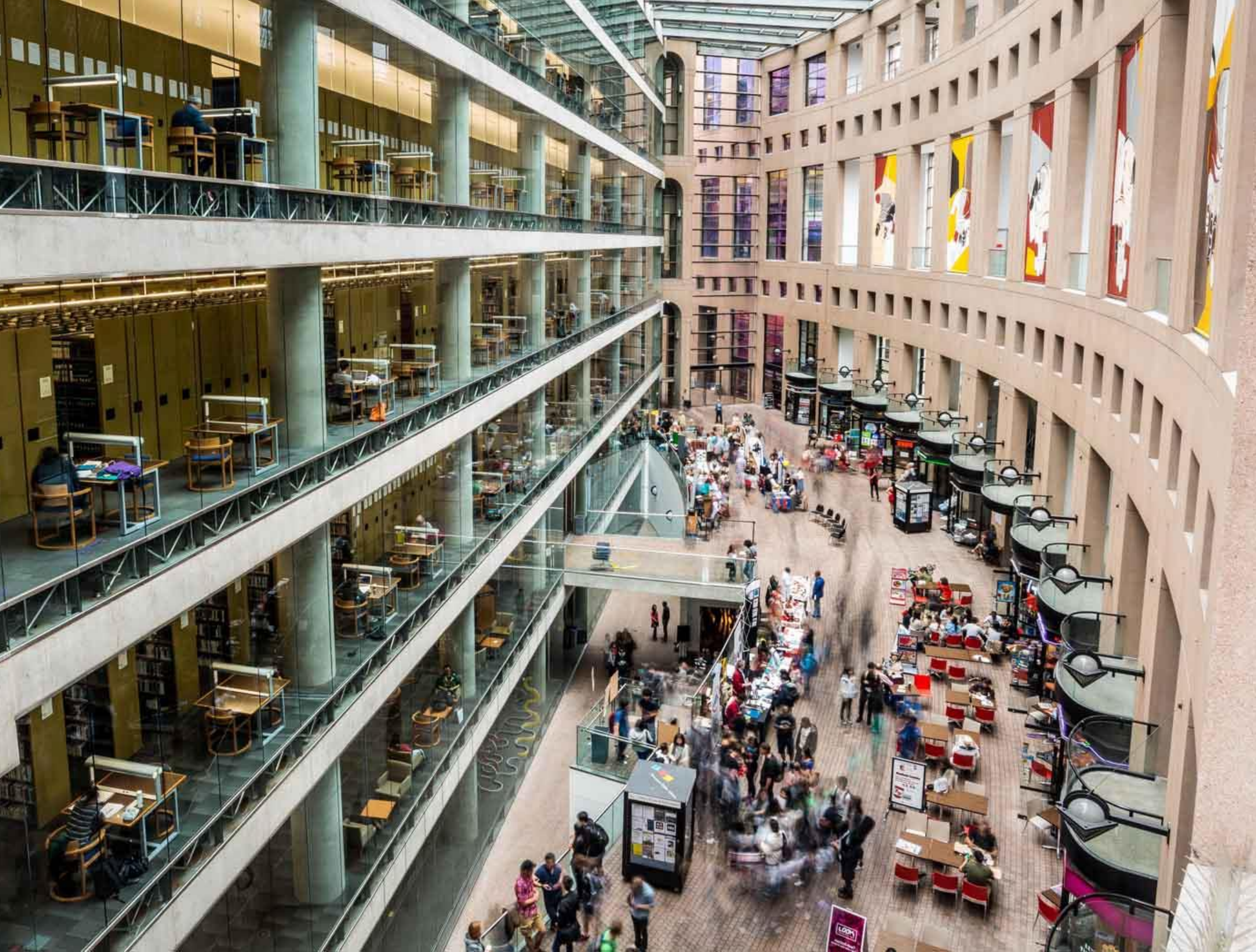
Vancouver Public Library