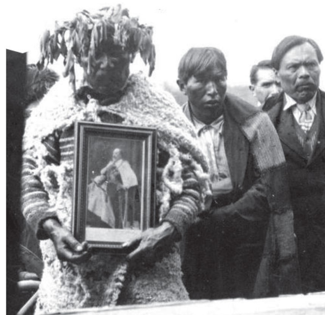
"The Picture of the King" Item H-03662

Reconciliation: Opening the Door to Conversations