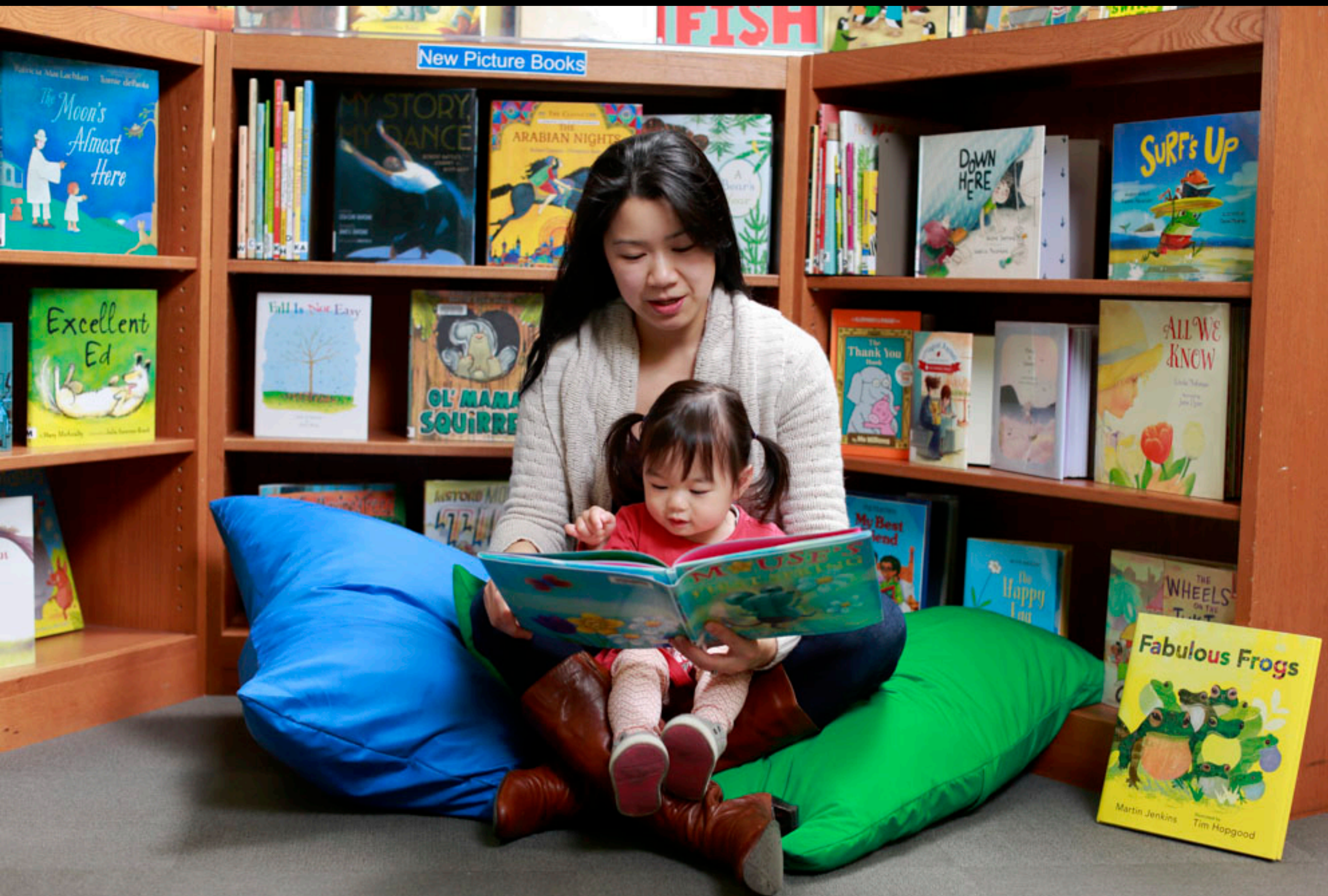
Vancouver Public Library