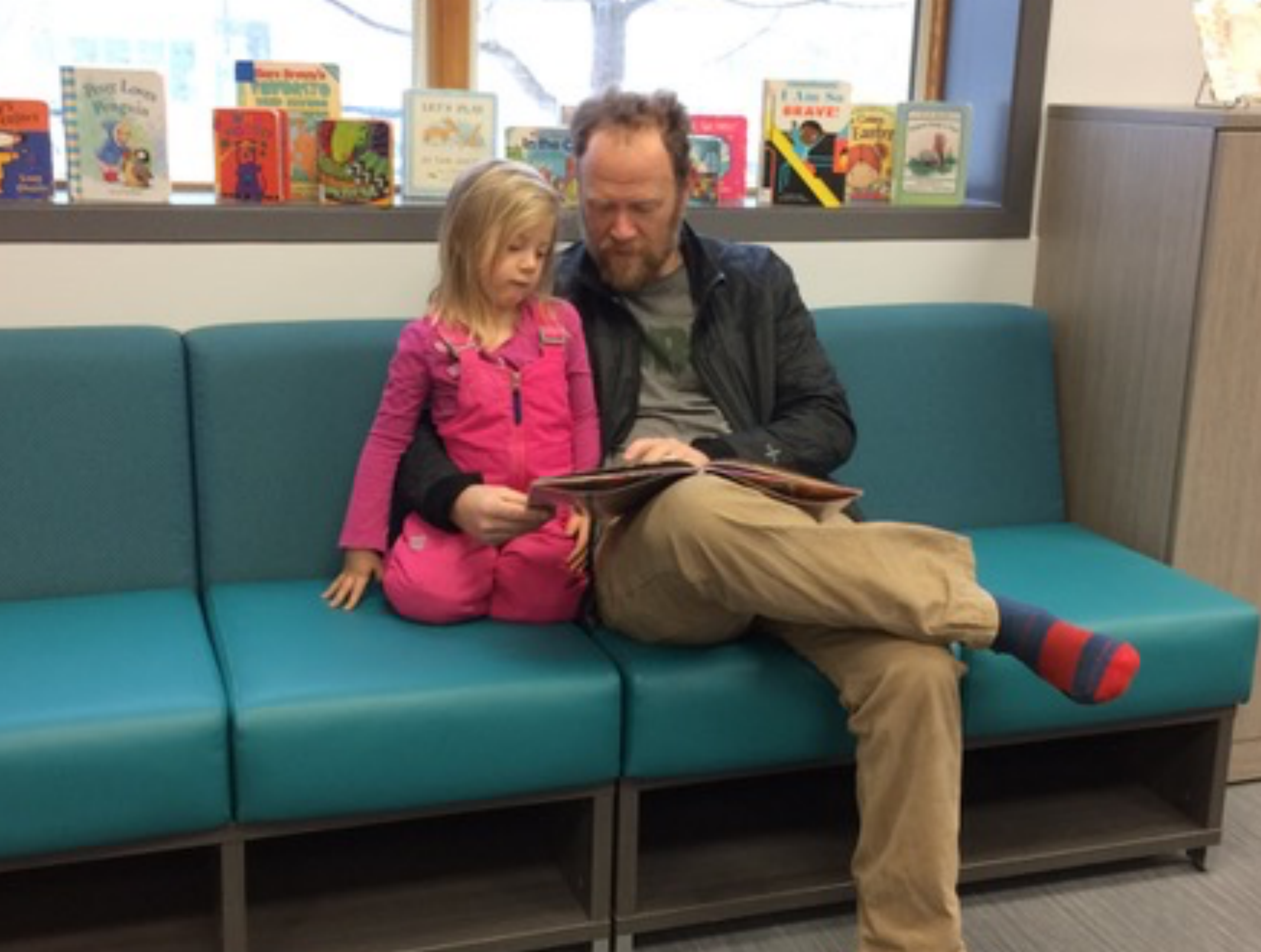
Rosland Public Library