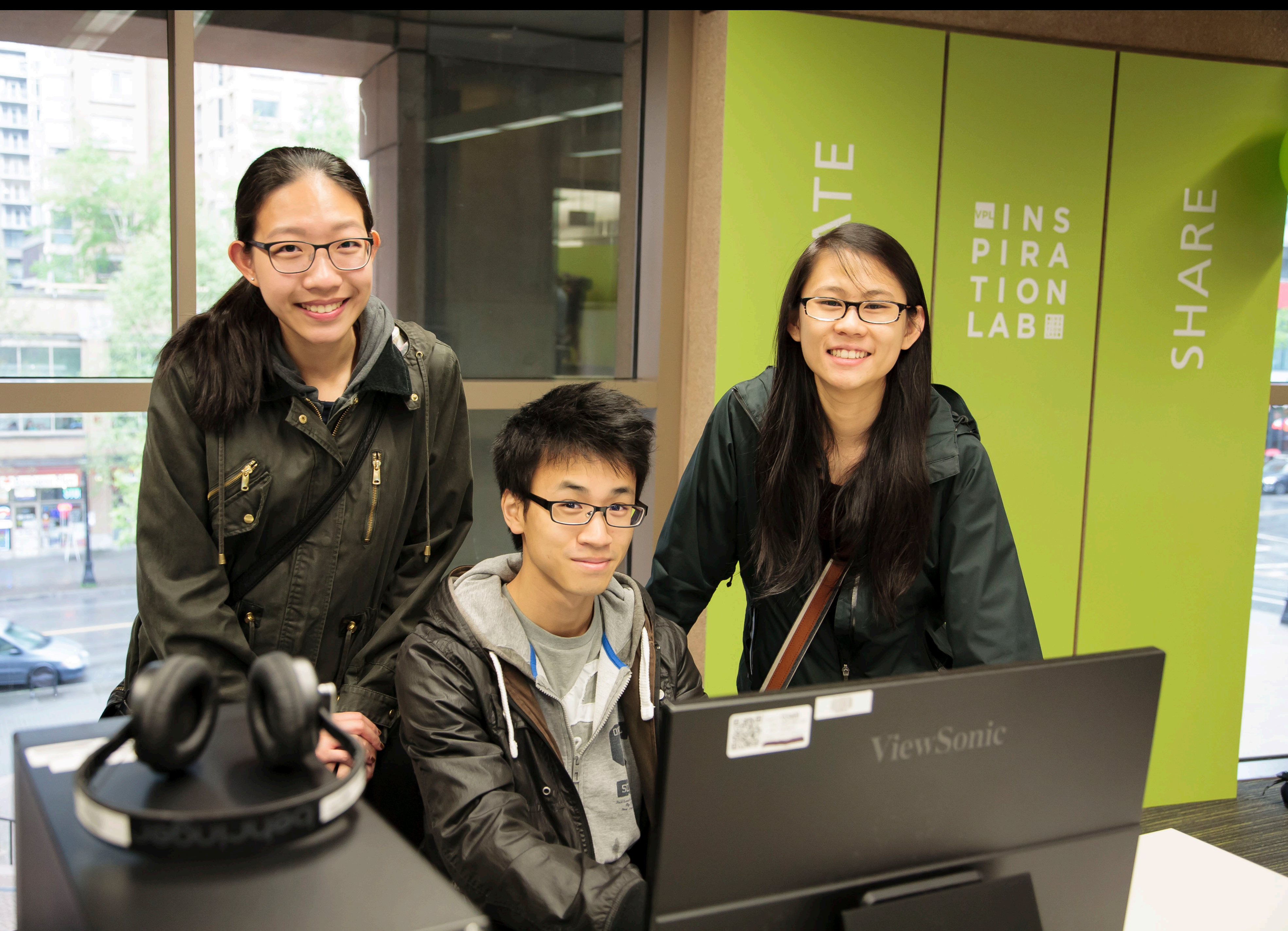
Vancouver Public Library