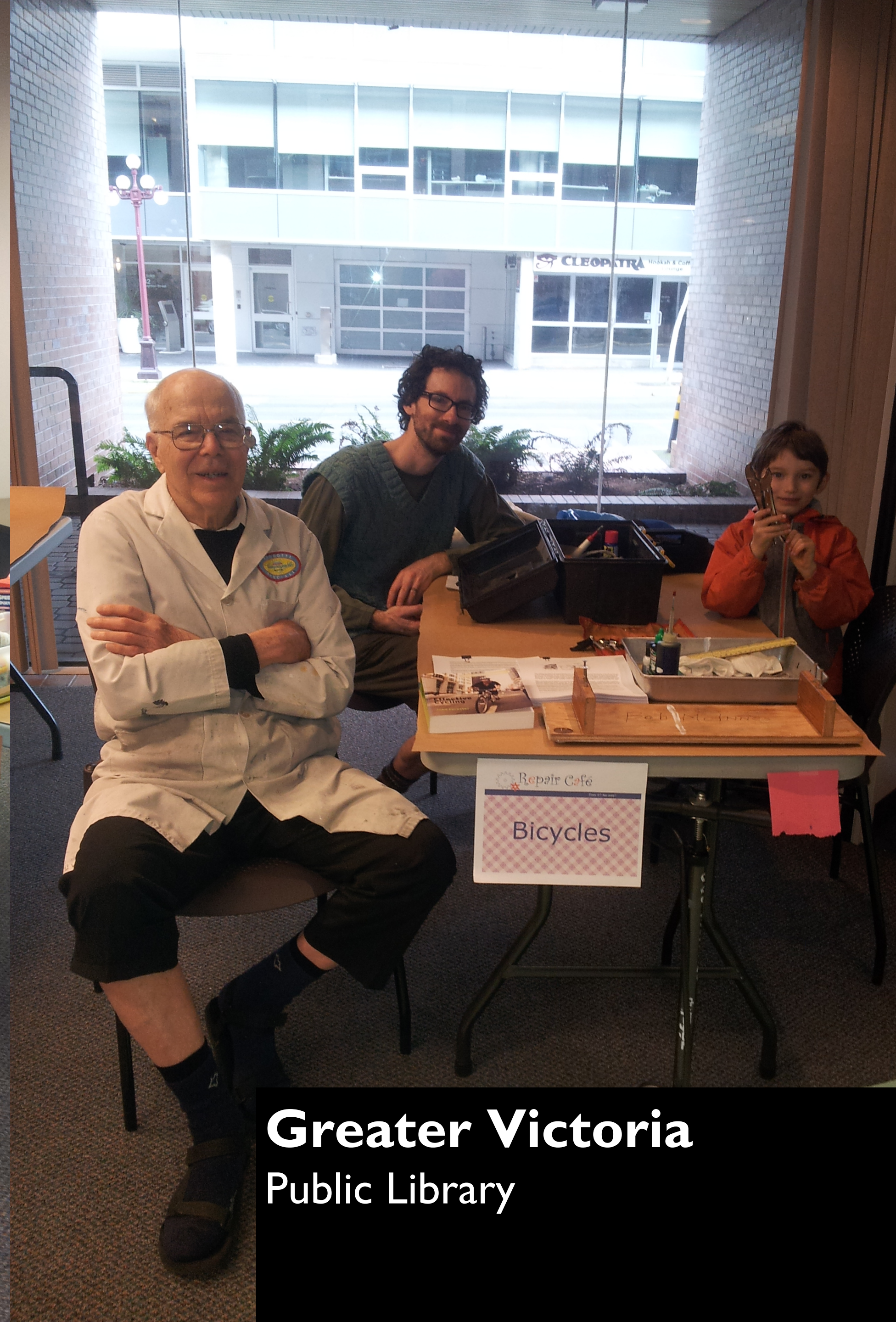
Greater Victoria Public Library