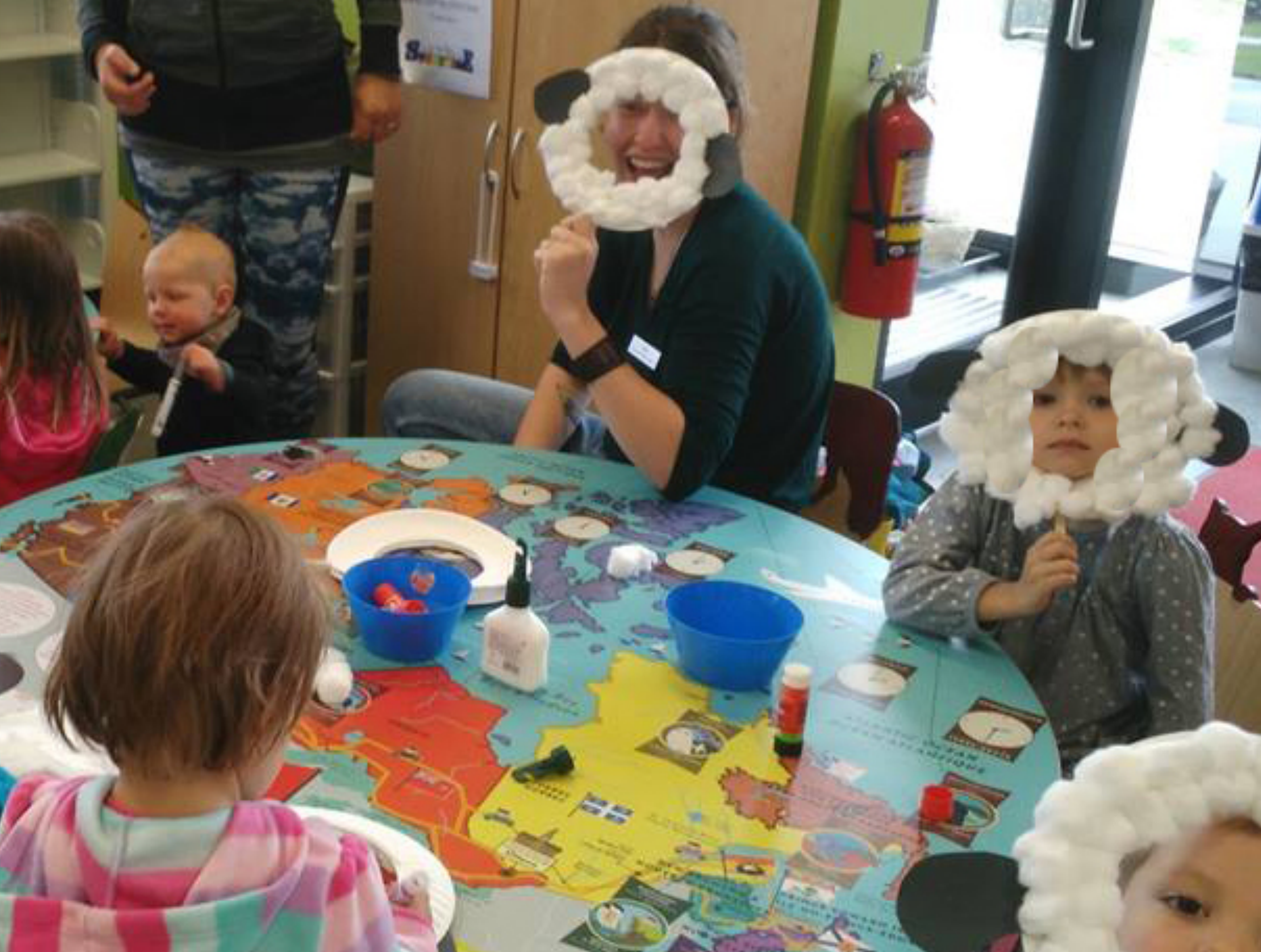
Invermere Public Library