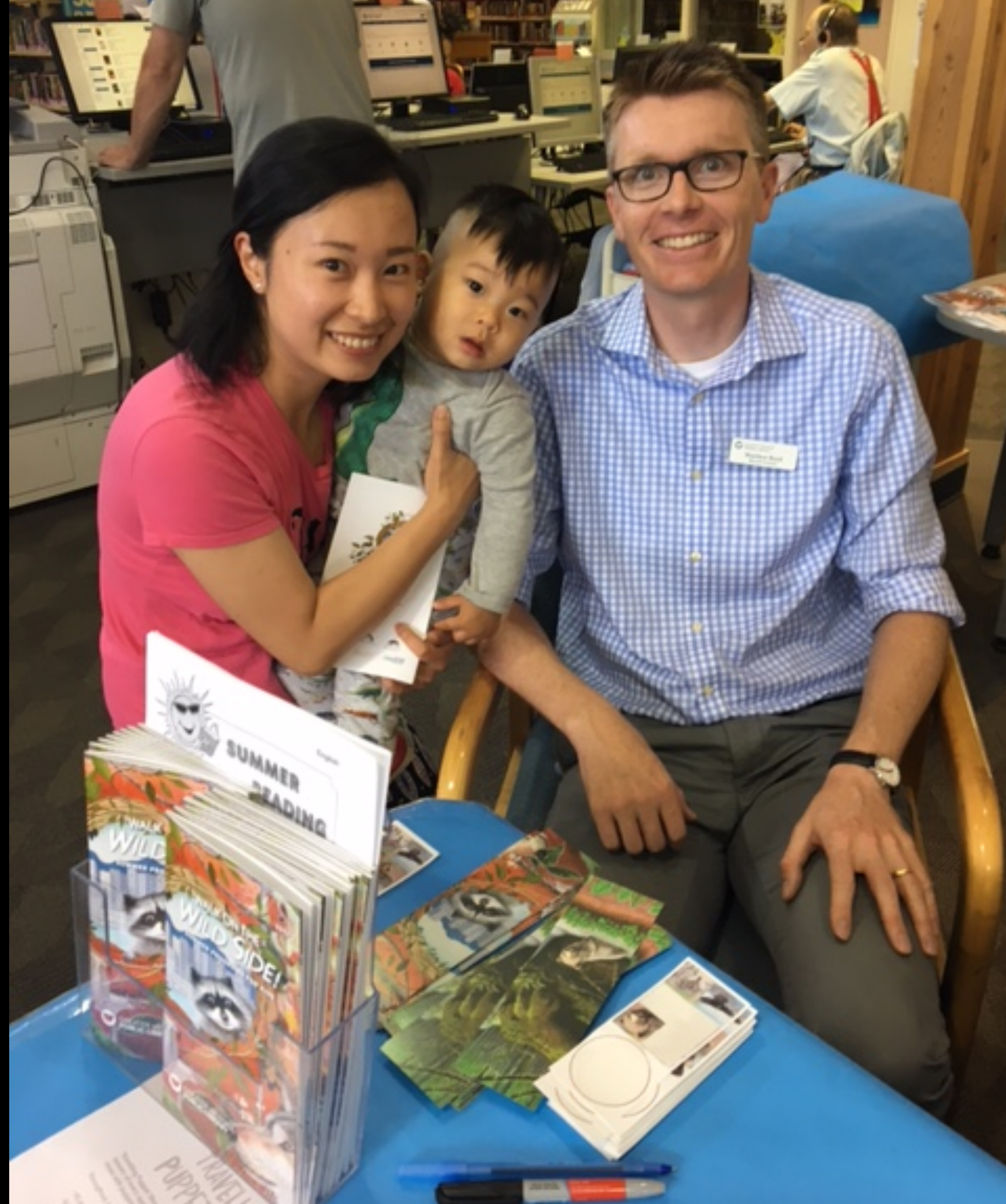
Greater Victoria Public Library