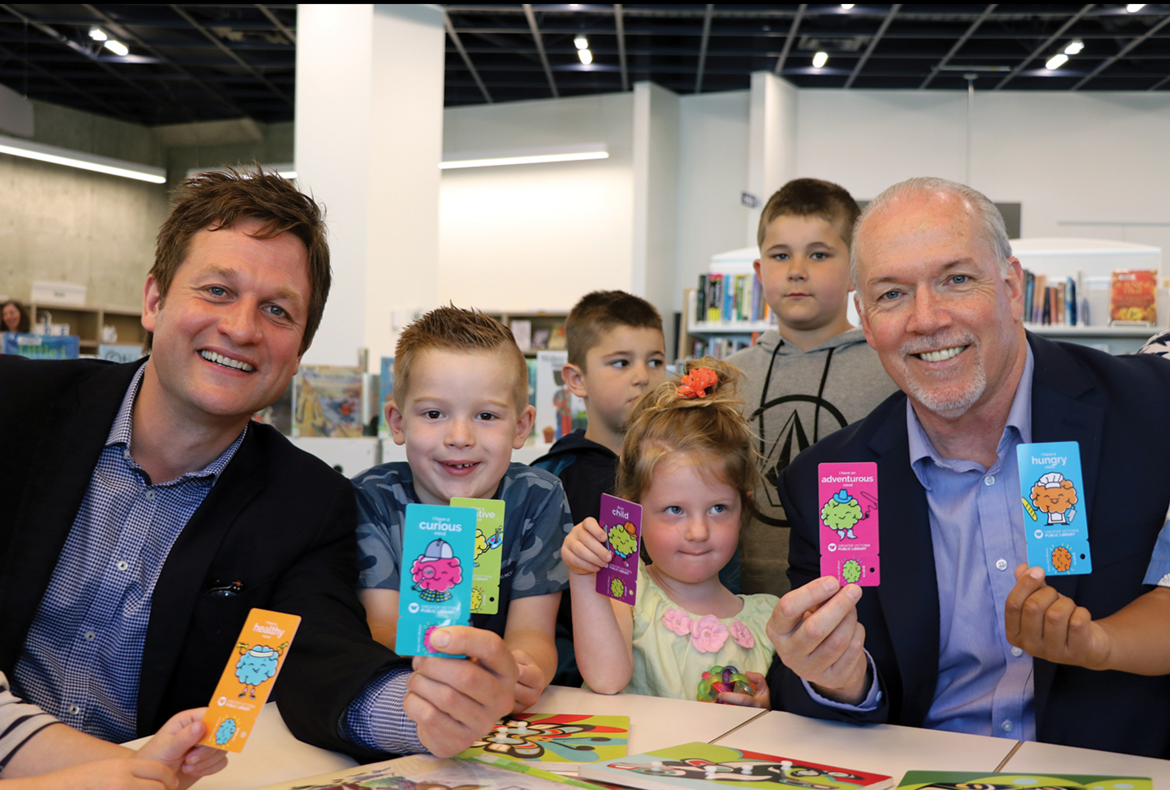
Greater Victoria Public Library