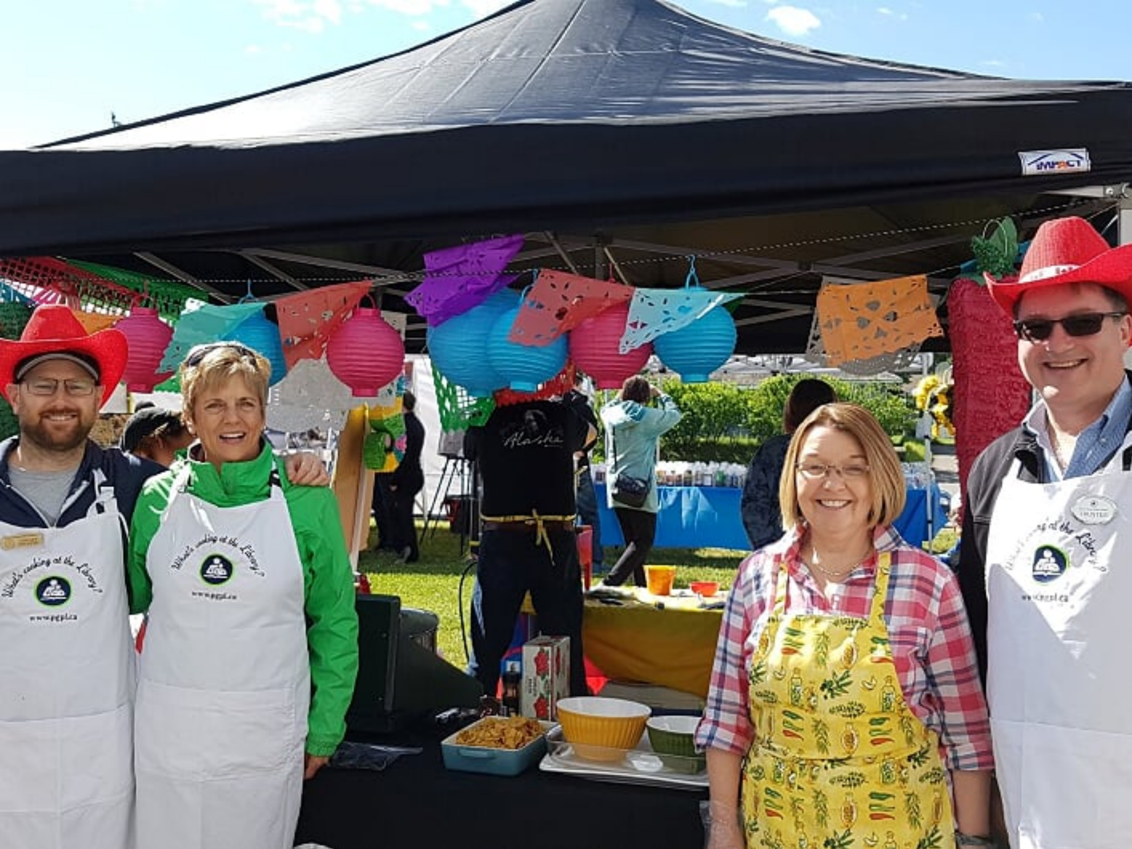
Prince George Public Library