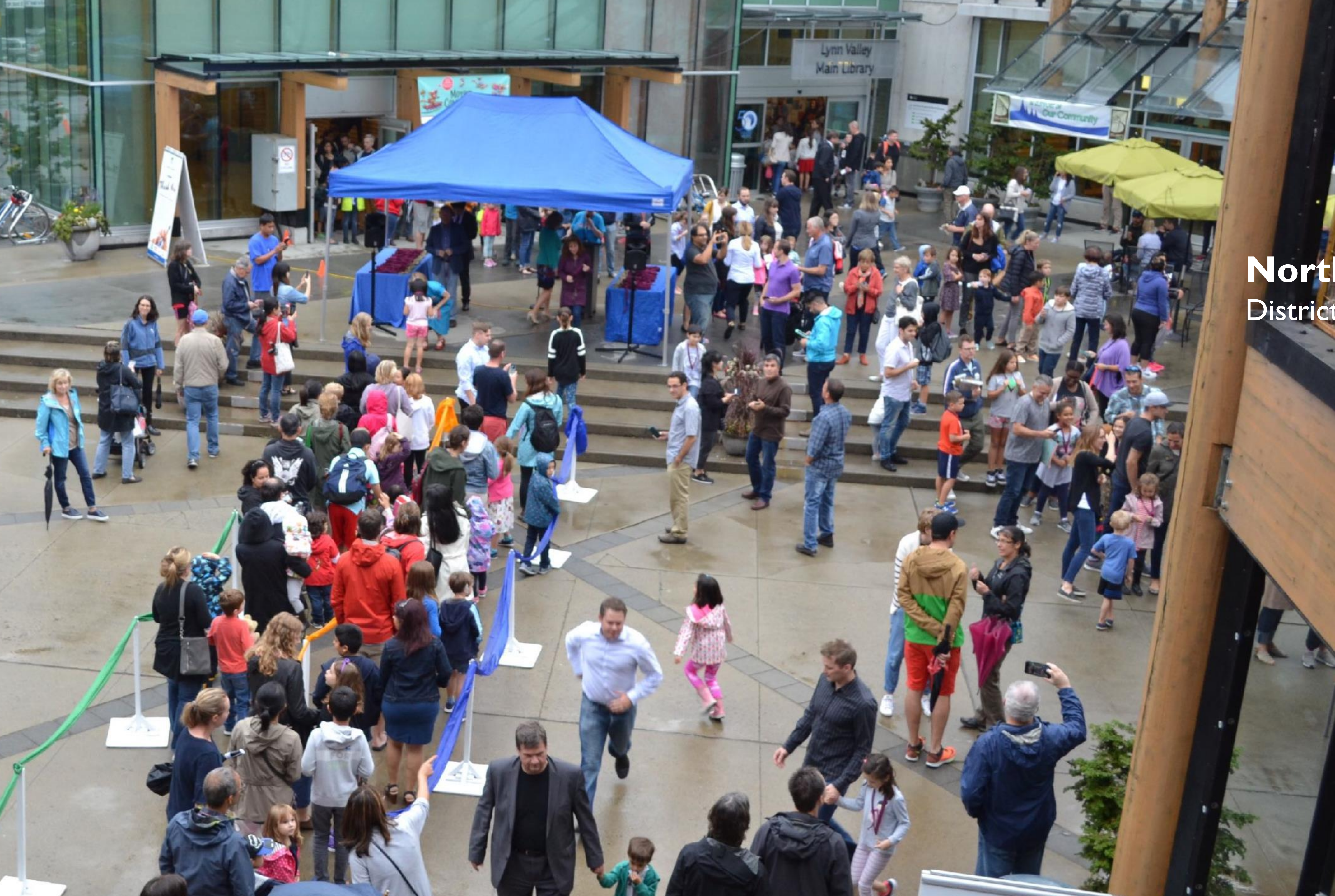
North Vancouver District Library