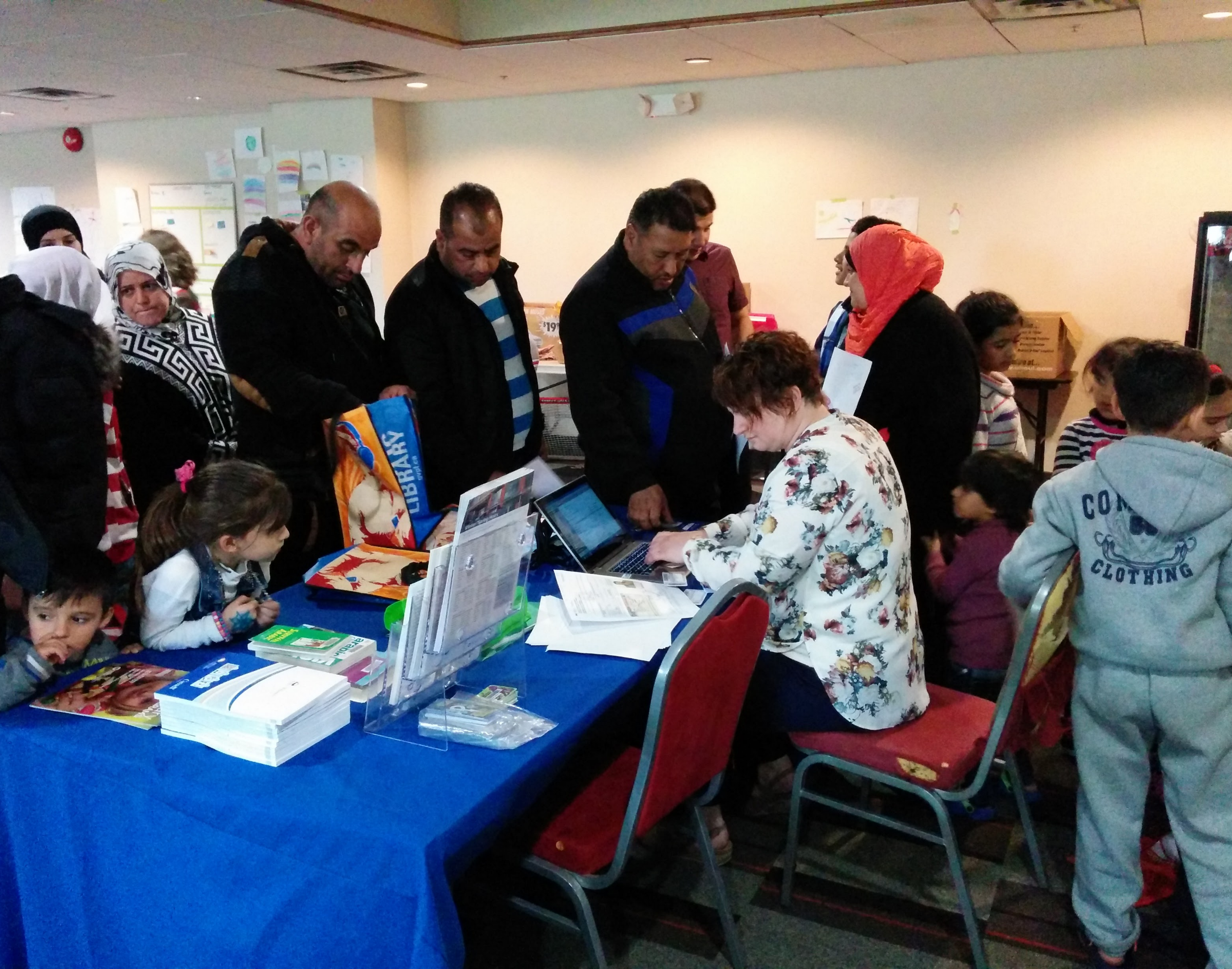
Greater Victoria Public Library