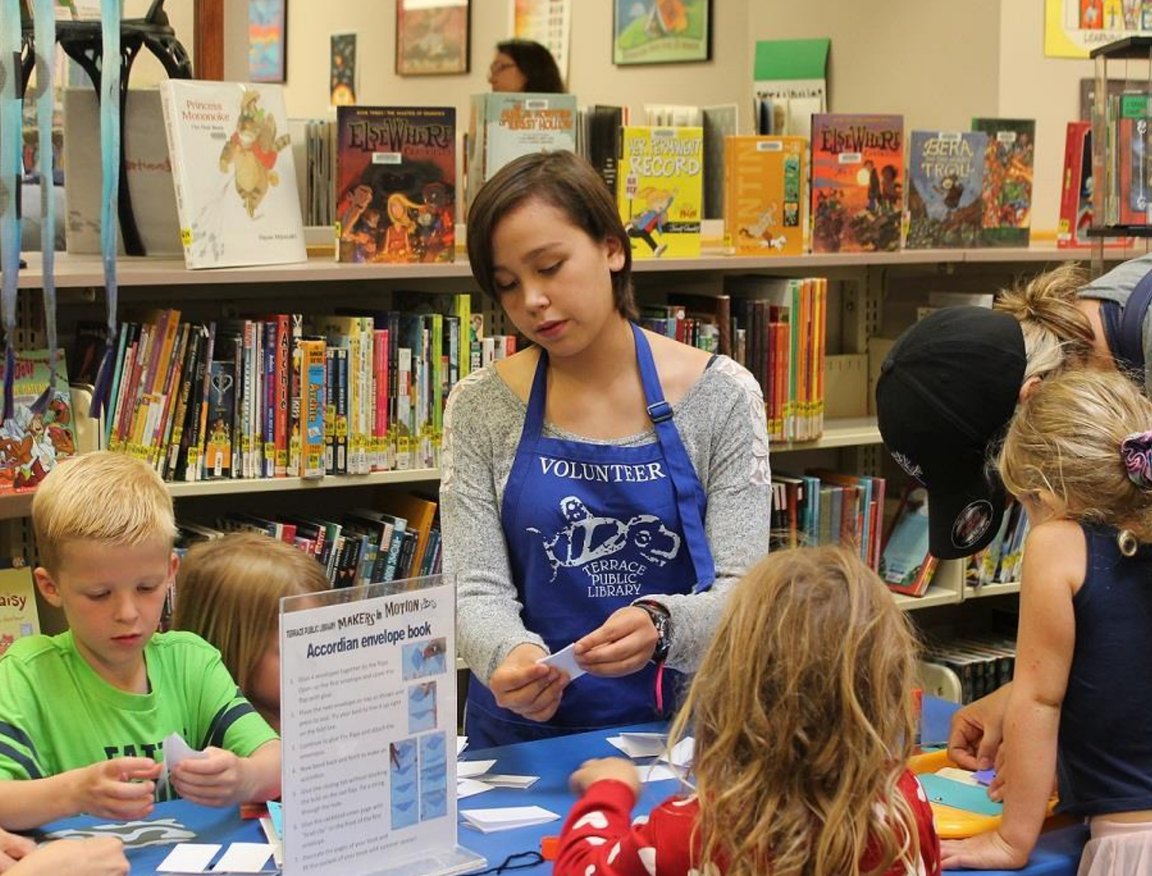
Terrace Public Library