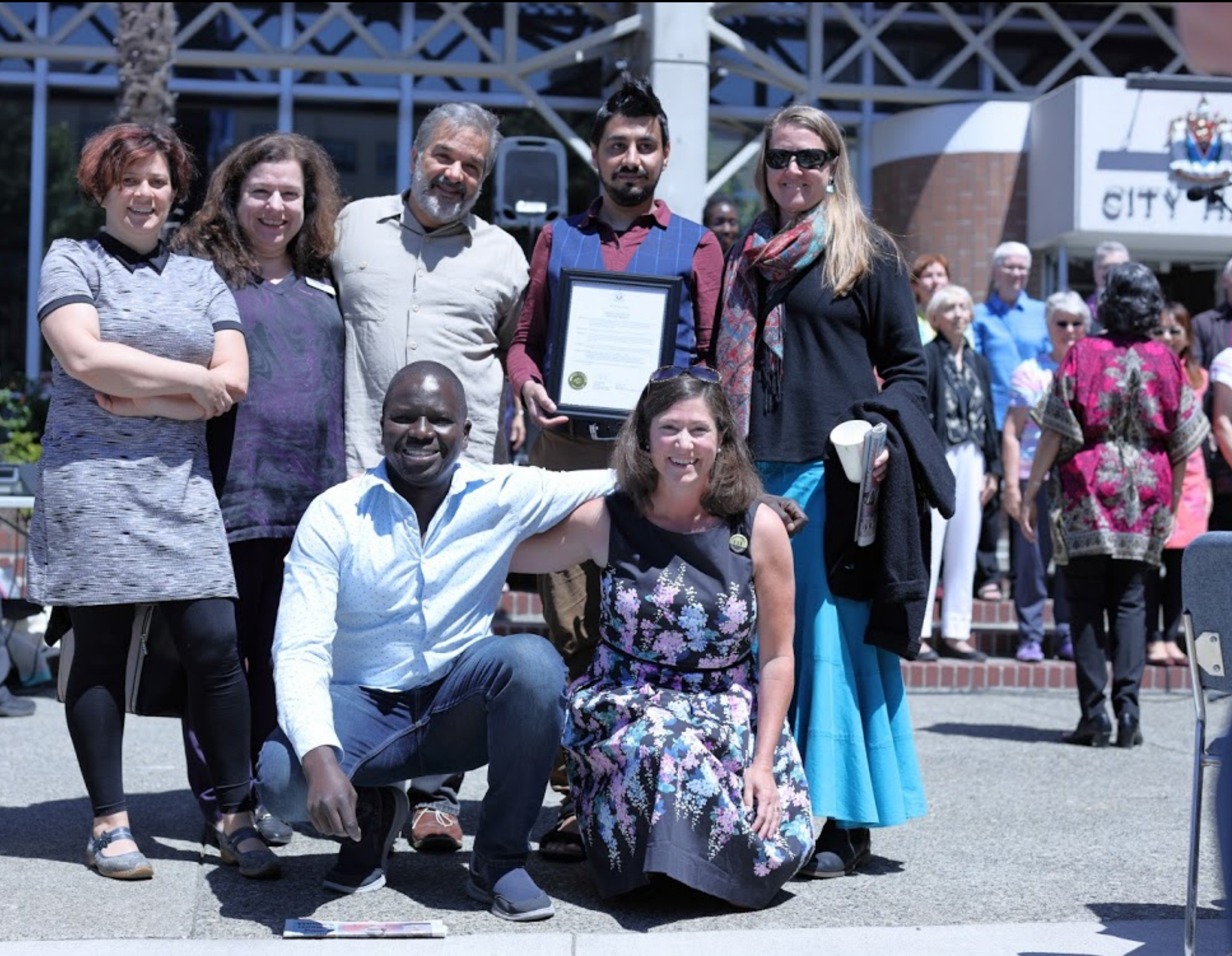
Greater Victoria Public Library