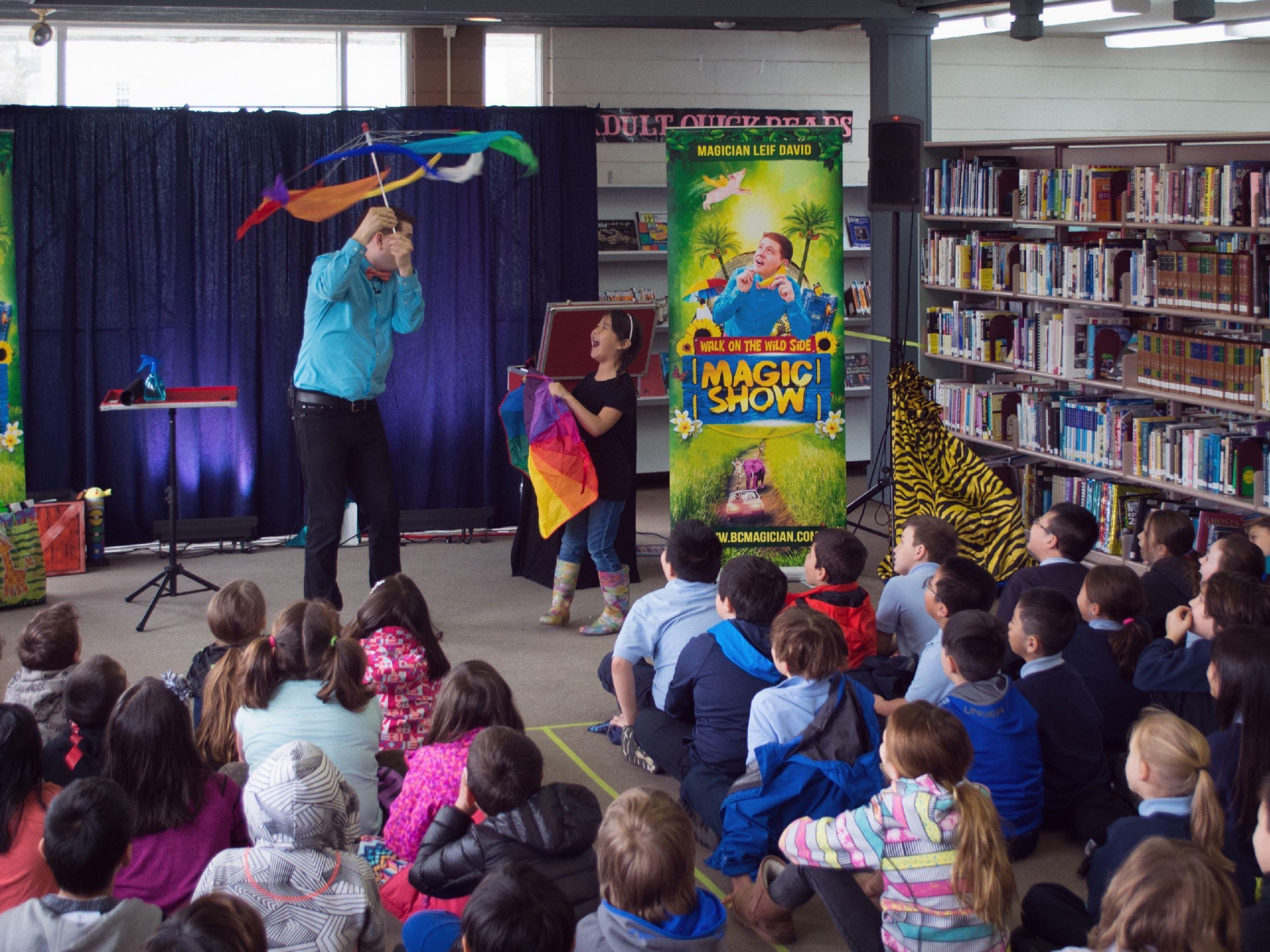
Prince Rupert Public Library