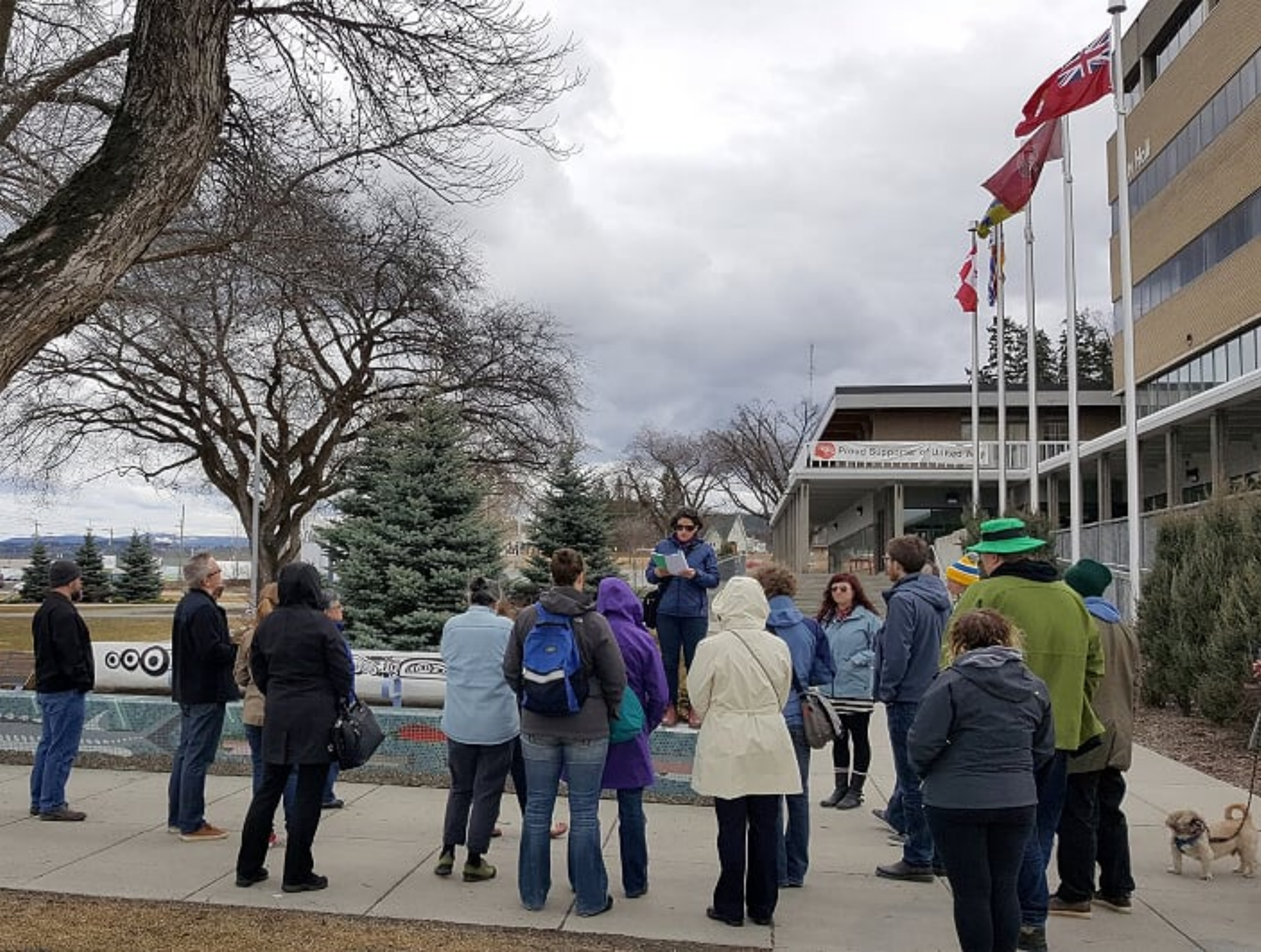
Prince George Public Library