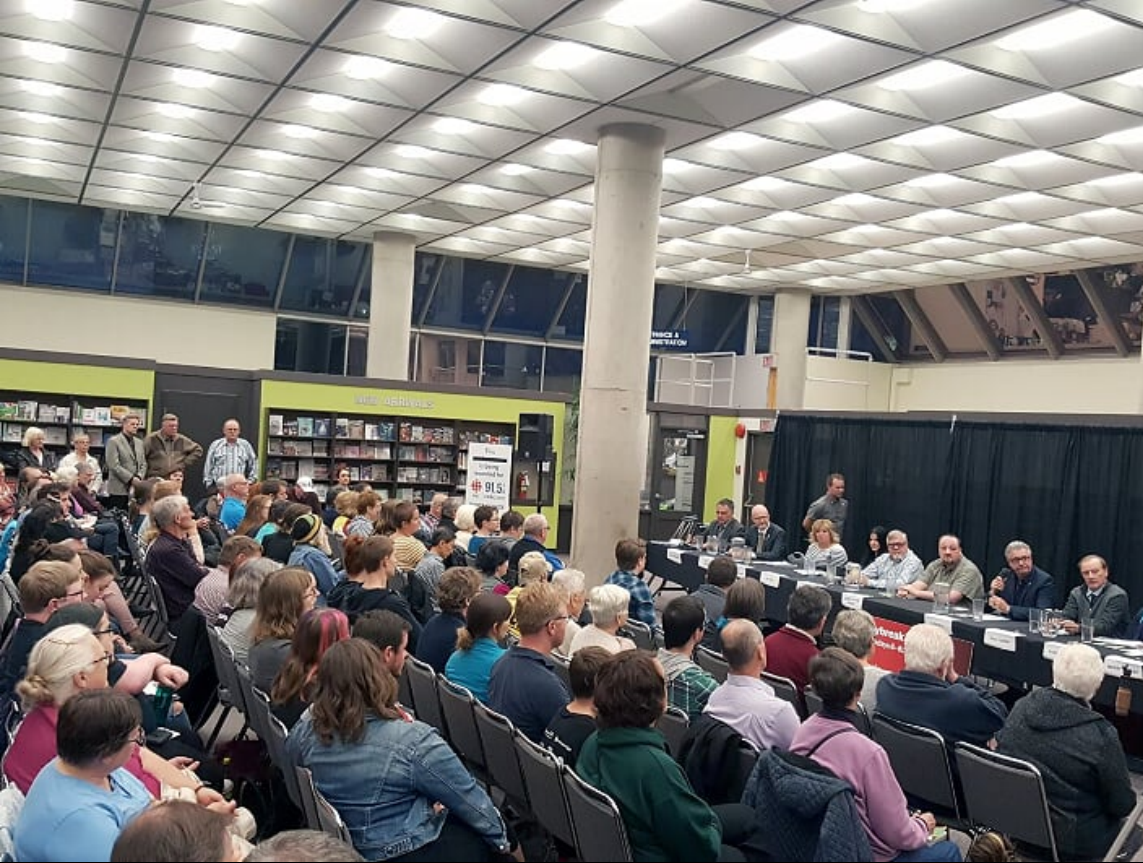
Prince George Public Library