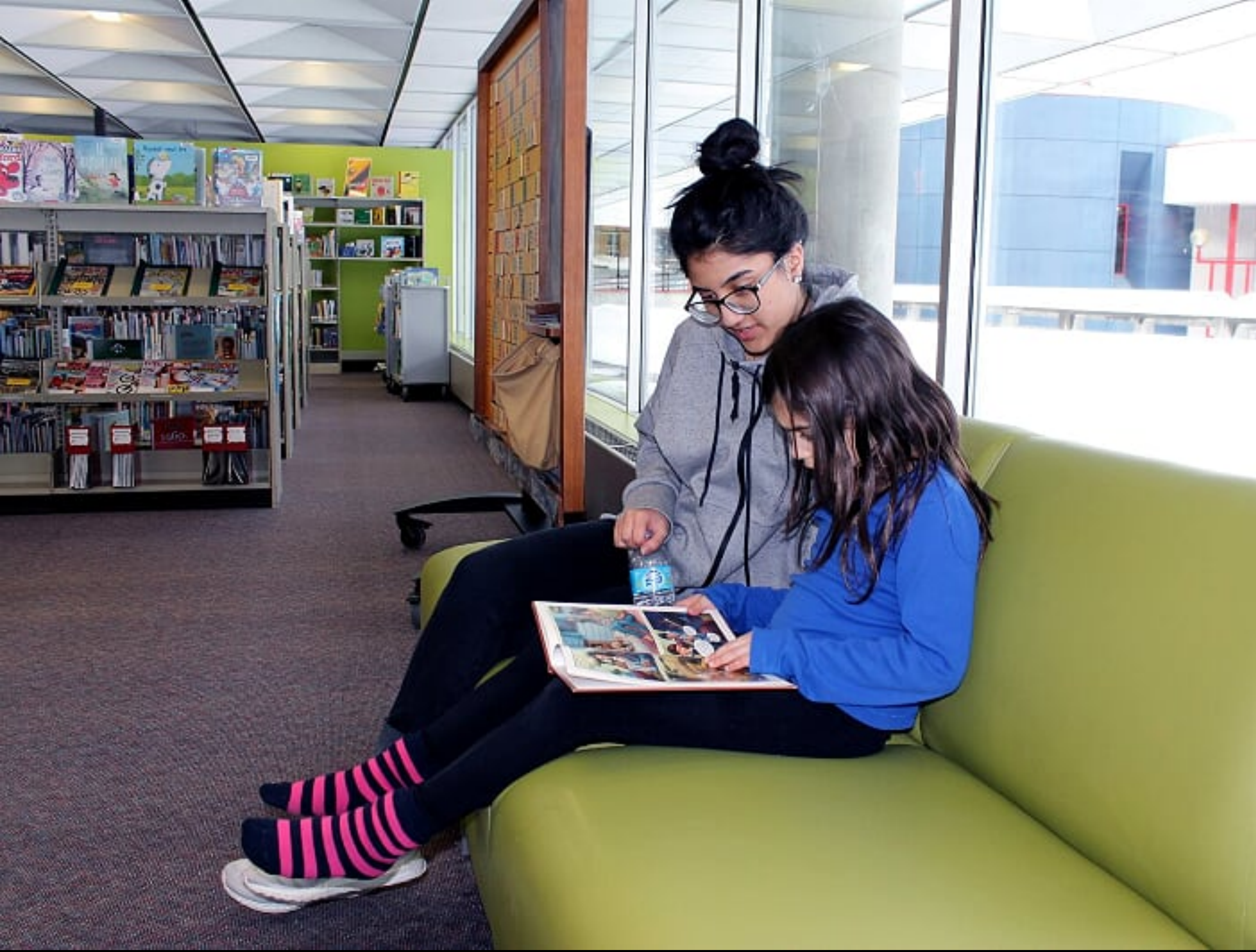
Prince George Public Library