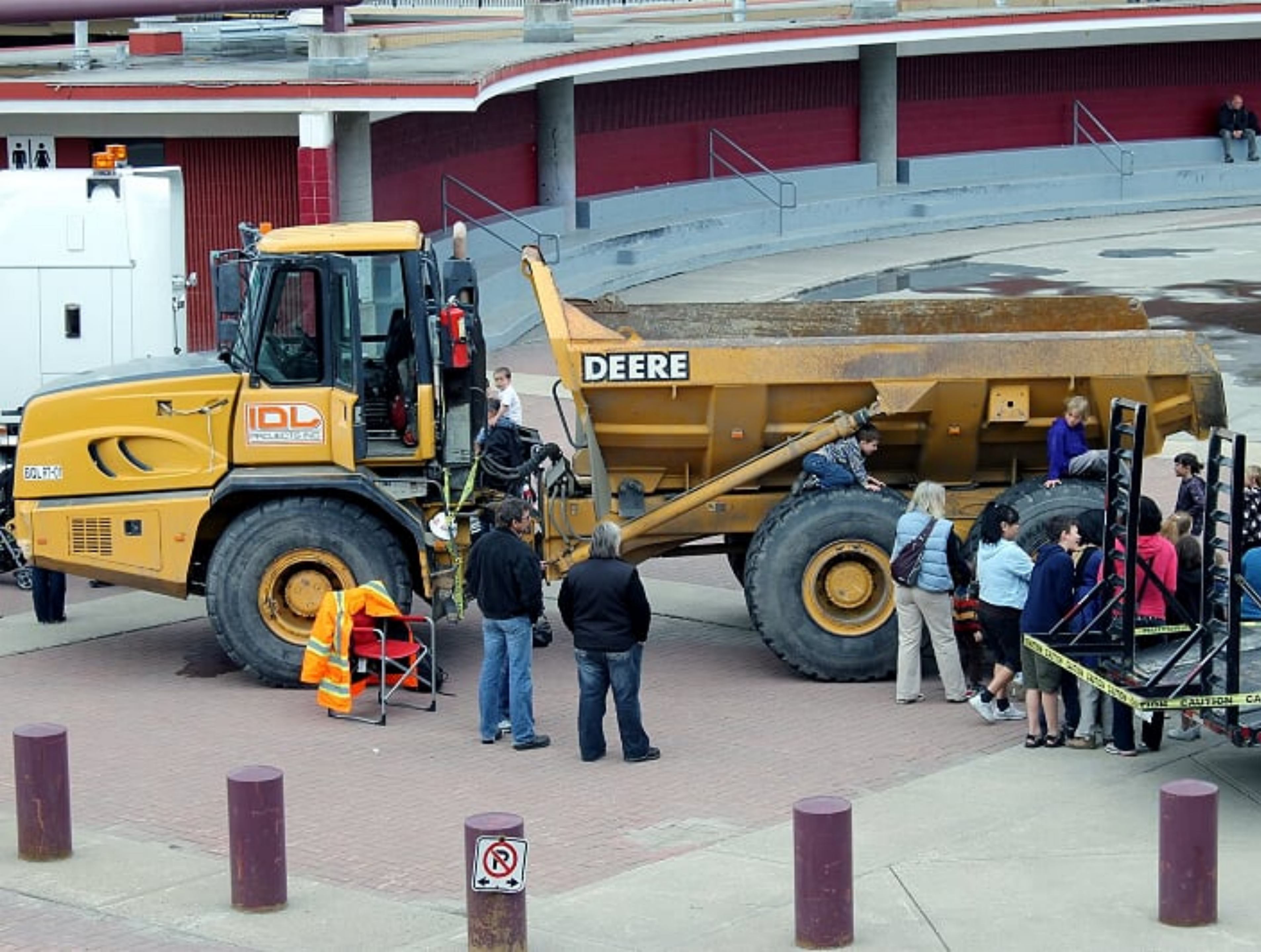
Prince George Public Library