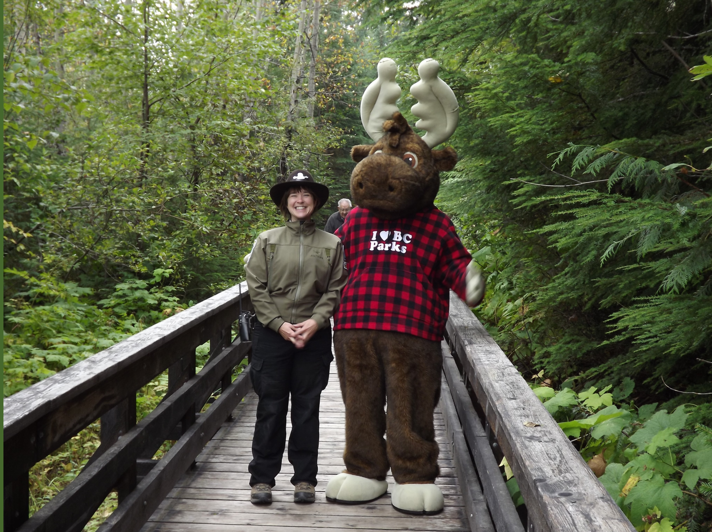
Park Ranger with Jerry the Moose 2019