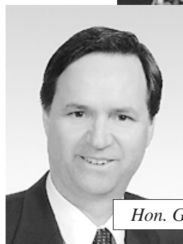
Hon. George Abbott

Cabinet Panels (not pictured) 25 Provincial Cabinet Ministers will participate in five panels Wednesday at 3:00 p.m. – short presentations from Ministers followed by question-and-answer period.