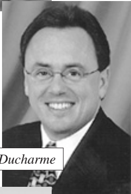
Mayor Yves Ducharme