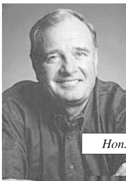
Hon. Paul Martin

Cabinet Panels (not pictured) 25 Provincial Cabinet Ministers will participate in five panels Wednesday at 3:00 p.m. – short presentations from Ministers followed by question-and-answer period.