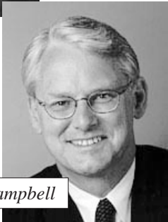
Hon. Gordon Campbell