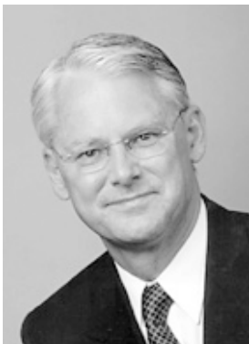
Premier Gordon Campbell

PREMIER GORDON CAMPBELL , speaking to delegates on Thursday afternoon, expressed confidence in the future prosperity and stability of British Columbia, in spite of recent events in the States and the economic challenges facing the province. "The events of September 11 th have shattered the things that were taken for granted, and created vast clouds of pain and uncertainty," he stated. However, he continued, as illustrated in both New York and Washington, there is nothing stronger than the spirit of community.