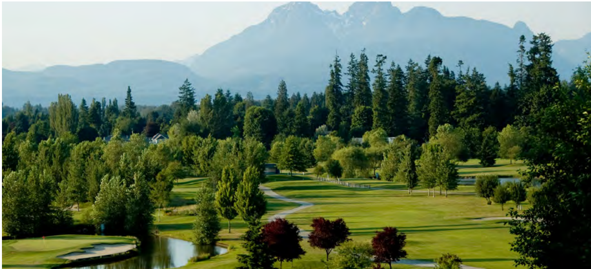
Langley Township, BC