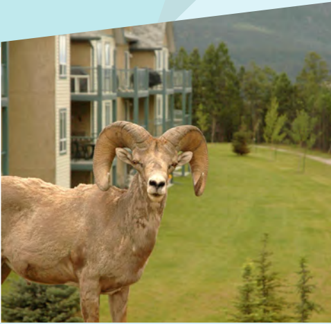
Radium Hot Springs, BC