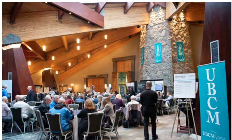
2018 Convention in Whistler, BC