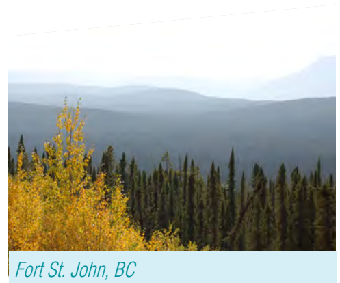
Fort St. John, BC