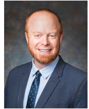
Mayor Jack Crompton Resort Municipality of Whistler LMLGA Representative Convention Committee Community Economic Development Committee