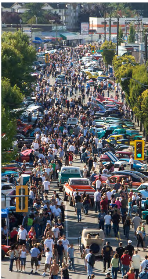
Langley City, BC