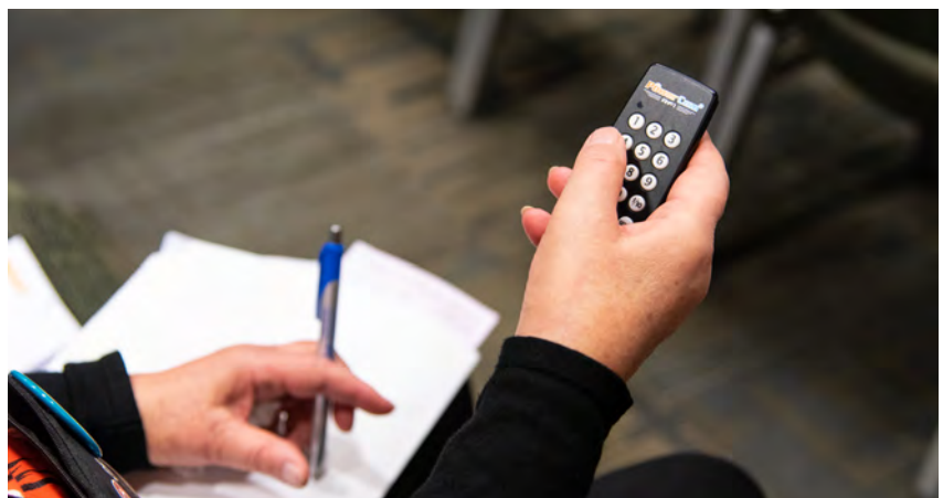
2018 UBCM Convention