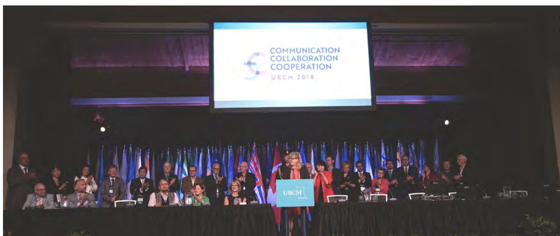
2018 Convention in Whistler, BC