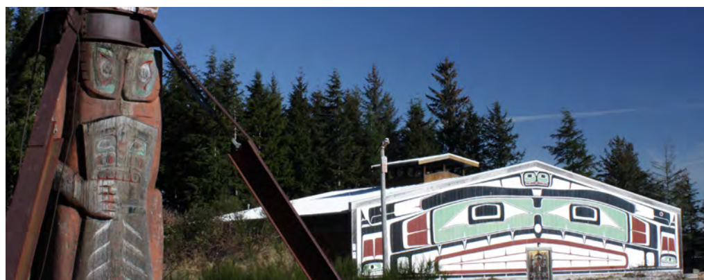
Alert Bay, BC